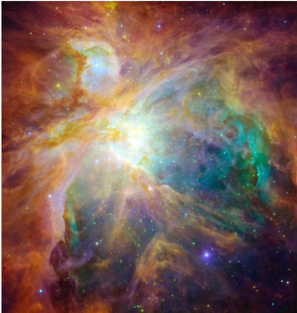
Figure 1: This composite image of the Orion Nebula, retrieved by the Hubble Space Telescope and the Spitzer Space Telescope, shows gaseous swirls of hydrogen, sulfur, and hydrocarbons that hold a collection of infant stars.