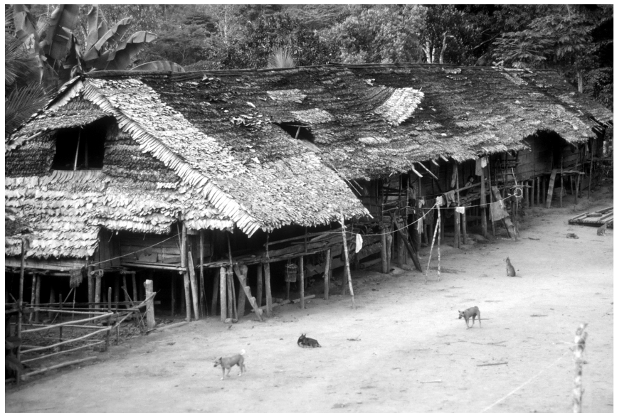
Fig. 1: The last remaining long-house in Apau Ping, Bahau region.