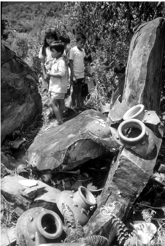
Fig. 2: Collapsed dolmen “cemetery” Pa Tenam, near Long Umung, Krayan Darat district.

aging feature is that nothing is being done to conserve the few still extant reminders of the culture of past centuries. Of the urn-dolmen burial site at Long Pulung, Sellato reports: “Recently it was . . . protected by a wooden fence with a locked door” (1995: 74). In 2003, as part of a group, I visited this site and found no sign of a fence. Several of the urn dolmens had been upended by rising tree roots. And it has been decided that the National Park’s museum, archives, and central administration are to be located in Malinau – a city not only rapidly purpose-built as the modern capital of the Malinau administrative district, and lacking any tradition of its own, but also remote from all that is worth seeing in the KMNP itself. 3