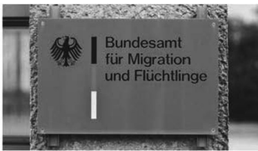
The majority of the refugees come from Syria, Serbia or Eritrea.

Still, the numbers of arriving asylum seekers are increasing. Owing to the crises going on in Africa and the Middle East the amount of people fleeing from their homes is becoming the largest since World War II. In the entire year of 2014 the Federal Office for Migration and Refugees expects around 200,000 asylum seekers. Here in Germany they search for protection and security. But how will this country handle the growing number of migrants?