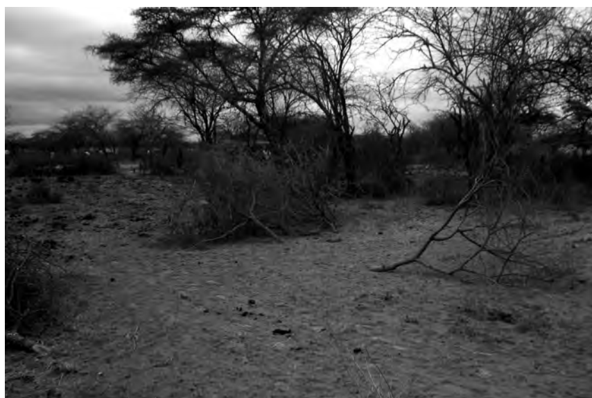
Fig. 4: Butumee (source: author's fieldwork, August 2012, Gumi Gayoo).

In the absence of any cattle in the kraal, the butumee is not pulled back inwards. Instead, it is left abandoned and the Borana often express it as “ ya butumee ala na kayani ,” meaning “I lost all my cattle and my butumee remained outside of the gateway, there is no reason to pull it back in” (see Leus and Salvadori 2006: 94f.). Thus, butumee is what it is in the presence of cattle in the enclosure. Leus and Salvadori further state that the butumee and the kraal gateway are ritually important. The Borana who want to enter the kraal for ritual purposes usually line up behind the butumee , which marks the area of the enclosure. One instance of this is that a fiancé, when he arranges marriage with his fiancée, has to visit her parents with certain culturally prescribed gifts. Usually he spends the night with his in-laws. However, regardless of the time of his arrival, he never enters the house before the cattle of the family has returned home. He is supposed to stay behind the butumee of his fiancée's family and to enter the kraal following the livestock through the kraal gateway. Similarly, a bride is not allowed to enter the house of her in-laws before the return-