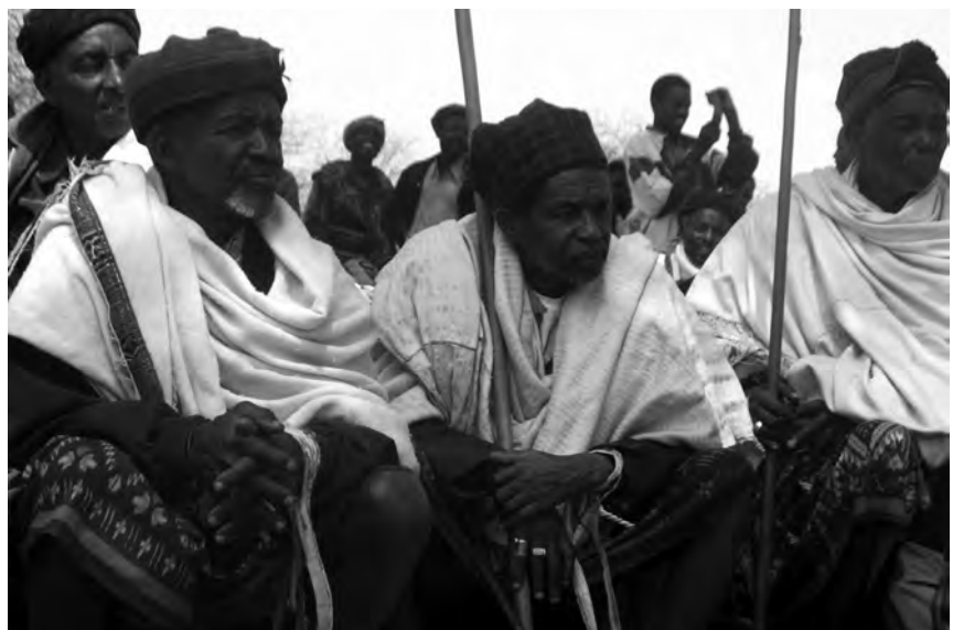
Fig. 3: The photo shows medhicha worn by the Borana qaalluu of the Karrayyu clan and his councilor on their wrist on the occasion of a gadaa general assembly. They wore a strip of skin taken from a slaughtered animal, either for daily consumption or a special ritual act. Medhicha is worn to indicate the participation in the ceremony or feast when the animal is sacrificed. It also indicates that the blessing pertinent to the sacrificial extends to the bearer of the bracelet. Furthermore, it is used to indicate honor of the guest for whom certain animal is slaughtered (source: author's fieldwork, August 2012).

Such webs of political, cultural, economic, and psychological ties are often updated through ritual gift exchanges. As forms of this common social phenomenon the Borana have similar cultural ties and