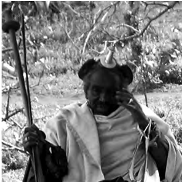
Fig. 2: Kallacha is a phallic gadaa symbol, usually worn on the forehead by the Borana male and gadaa leaders when performing certain rituals (source: author's fieldwork, October 10, 2010).

leaders. On this occasion the Borana gadaa and Konso ritual leaders physically meet each other. The Borana gadaa leaders go to the Konso land with livestock and salt as gift for the Konso represented by their ritual leaders. The gadaa leaders provide oxen, castrated sheep, and goats, and salt of about thirty laden. On this occasion, in return, the Konso ritual leaders provide the Borana gadaa leaders with important cultural materials like kallacha (see Fig. 2), baddoo (white cotton cloth used as blanket), burana (beads), sorghum, coffee, and tobacco.