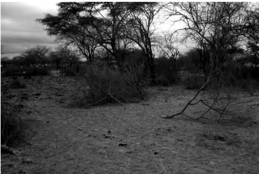
Fig. 4: Butumee (source: author’s fieldwork, August 2012, Gumi Gayoo).

In the absence of any cattle in the kraal, the butumee is not pulled back inwards. Instead, it is left abandoned and the Borana often express it as “ ya butumee ala na kayani ,” meaning “I lost all my cattle and my butumee remained outside of the gateway, there is no reason to pull it back in” (see Leus and Salvadori 2006: 94f.). Thus, butumee is what it is in the presence of cattle in the enclosure. Leus and Salvadori further state that the butumee and the kraal gateway are ritually important. The Borana who want to enter the kraal for ritual purposes usually line up behind the butumee , which marks the area of the enclosure. One instance of this is that a fiancé, when he arranges marriage with his fiancée, has to visit her parents with certain culturally prescribed gifts. Usually he spends the night with his in-laws. However, regardless of the time of his arrival, he never enters the house before the cattle of the family has returned home. He is supposed to stay behind the butumee of his fiancée’s family and to enter the kraal following the livestock through the kraal gateway. Similarly, a bride is not allowed to enter the house of her in-laws before the return-