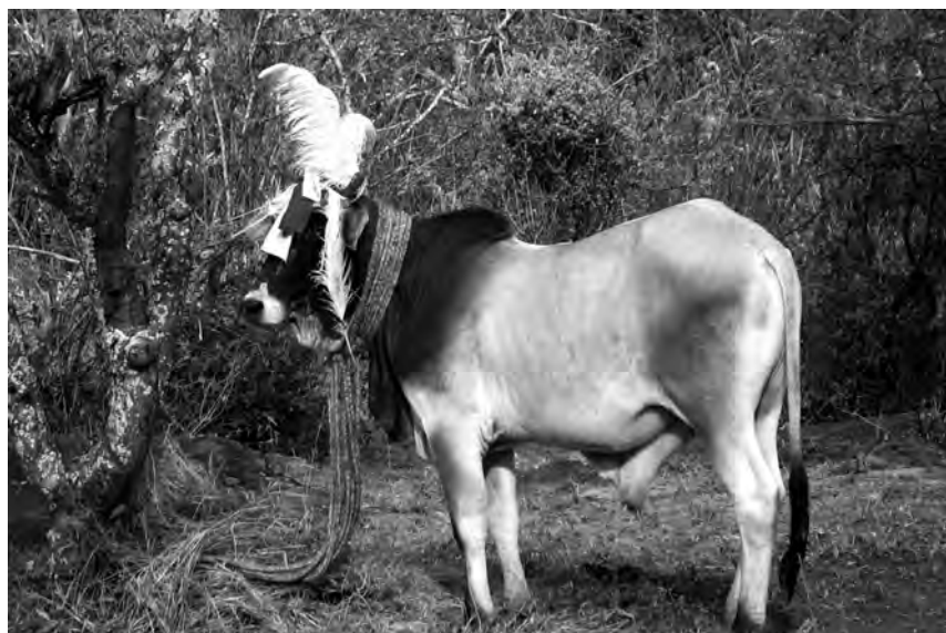
Fig. 1: Red and white colored gadaa banner ( baqqala-faajjii ) are hung on the head of a ritual bull on the occasion of the gadaa ritual called buttee . The bull is also known as buttee bull. The Borana receive the banner from the Somali group Eji as a gift.

a camel bull. They have also a ritual drum which is beaten on ceremonial occasions. The Gabra receive a bull from the Metta, a subclan of the Borana, to have a covering leather of the ritual drum. The Borana provide the bull for slaughter, as they believe that the performance of Gabra gadaa is so vital for peace and prosperity. It is believed that the Gabra's ritual activities have the power to change the situation in favor of wellbeing, good conditions ( finna ), health, and fertility of the land.