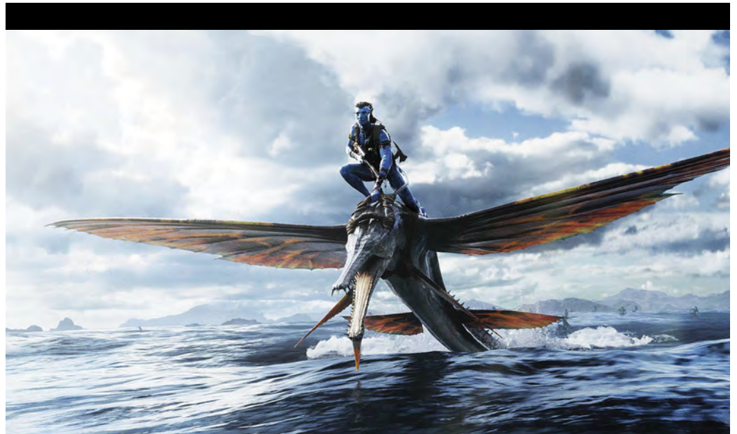
FIG. 2 AVATAR: THE WAY OF WATER (2022)

experience of avatars, an insight that stands contrary to the “uncanny valley” hypothesis. Rather, dominant are neutrality, contempt, and distance, because, as both neuroscientific experiments and experiences with cinema show, there is always a certain degree of familiarity that we can easily decipher and enjoy.