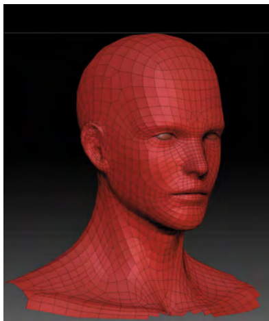
FIG. 3 3-D AVATAR MODEL HTTPS://LEEGOONZ.WORDPRESS.COM/2010/02/13/W-I-PREAL-TYPE-3D-CHARACTER-MODELING/