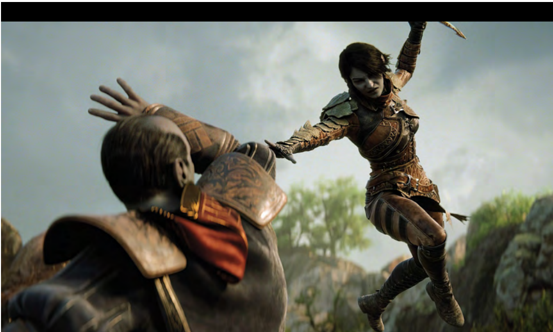
FIG. 4 SCENE FROM MORROWIND: THE ELDER SCROLLS (2017). HTTPS://WWW.BUFFED.DE/TESO-THE-ELDER-SCROLLS-ONLINE-SPIEL-15582/TESTS/MORROWIND-REVIEW-1229438/

Thus, despite all of its theoretical productivity, there is something lacking in actor-network theory, because the primacy of networks does not allow for a distinction between relationality and relatability. Like the graph theories that stand at the foundation of network theories, relations denote formal classifications that distinguish only between “nodes” and “edges,” but do not necessarily differentiate between the modes of classification that connect the networked elements to one another in varying ways. In short, as avatar-networks demonstrate, the deficiencies of actor-network theories lie in their lack of an adequate concept of modality that would relativize the concept of relation and, above all, enable a separation between relationship and relation , which is crucial for all forms of sociality. Cooperation, neighborliness, friendship, and dialogue can hardly be sufficiently described with the neutral concept of relation, and they do not adhere to the formalism of mathematical functions. This is why interhuman relationships are different than human-machine or human-avatar relations and relations between things, necessitating that a fundamental asymmetry be charted in the symmetry of networks from the very beginning. This is likely a reason why human-avatar relations, particularly in games, always have such a stereotypical form and why fighting —the quintessential form of binary relations—is dominant in them. At the same time,