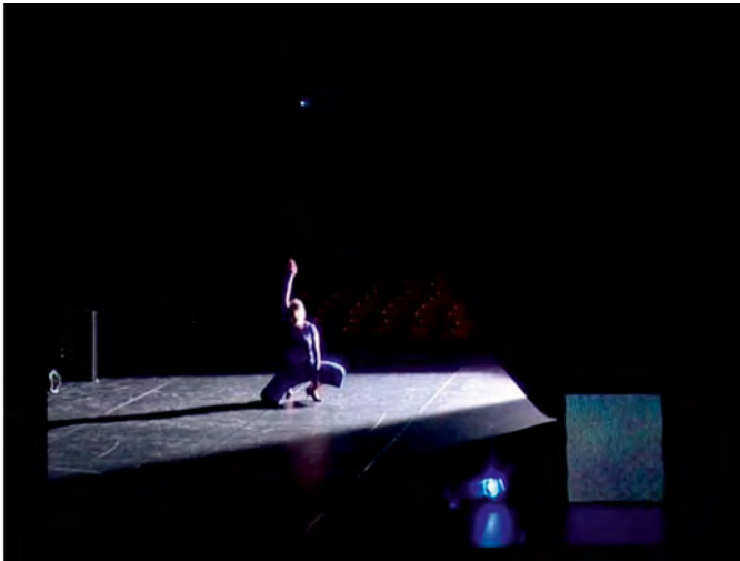
Figure 22: Film still from the video recording of Solo a ciegas (con lágrimas azules) . 56

the back of the stage and opens the black backdrop curtains to reveal the backstage area, where she performs a series of movements, including tango-based steps [Figure 22]. The physical space suddenly becomes bigger; an increase in the sound volume – tango music – contributes to this sense of opening, of escaping; some of the invisible equipment appears. For a moment, the universe on stage oscillates between evaporating – collapsing through the dissolution of its spatial boundaries – and expanding – to include the newly-visible elements. In this ambivalence, it becomes possible to realise that the piece has created a universe – an ambience-like existence – out of minimally-few disparate objects, words, actions, and images; by opening up to the “beyond” of the stage, and increasing the fragility of the relational arrangement that it has formed, the emergent relational entity is made manifest.