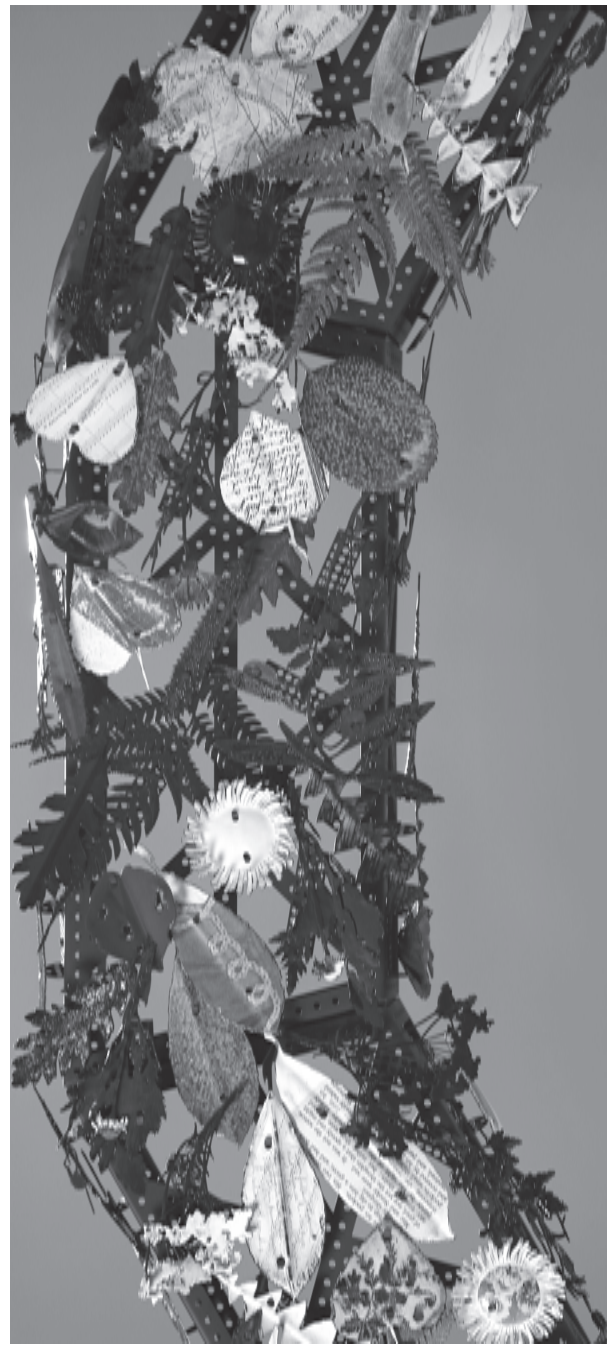
Flowers of War, ( Wreath detail ), 2018.