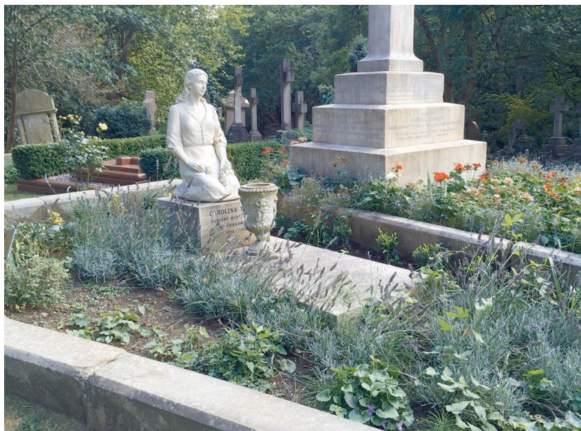
Fig. 4: The Grave of Caroline Tucker (1910–1994) in Highgate's East Cemetery (Image: Paola von Wyss-Giacosa 2016).

configuration, visible and tangible things, but also «such unbodylike entities as thoughts and memories.» 28 The individual grave does so through its position, through the tombstone with a name and dates, through its desolation or trimness, through an inscription or the visual representation of powerful symbols such as a rose, a lily or ivy, but also through the planting surrounding it, through a bunch of flowers, a candle or a personal object left behind.