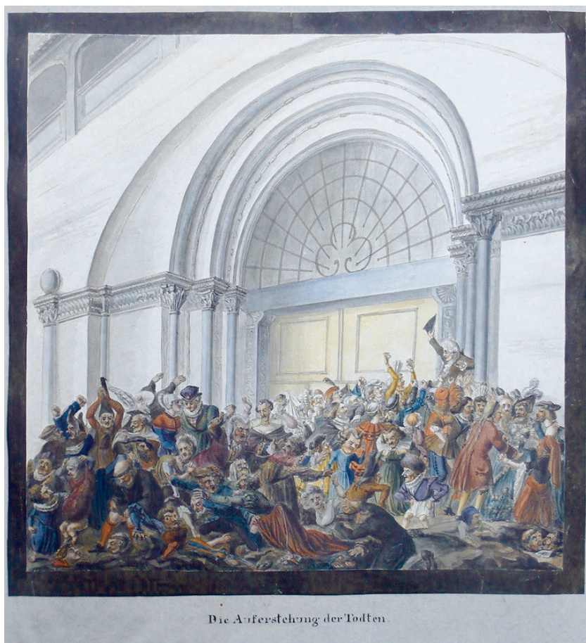
Fig. 1: Johann Martin Usteri, The Resurrection of the Dead , around 1796, pen and ink and watercolour on paper, mounted on paper, image size: 35 x 35,5 cm; paper size: 38,5 x 38,8 cm, Kunsthaus Zürich, Dept. Prints and Drawings, Bequest by Magdalena Oeri-Hess, Inv.-No.: Z.A.B. 2609.14 (Image: Paola von Wyss-Giacosa 2014).