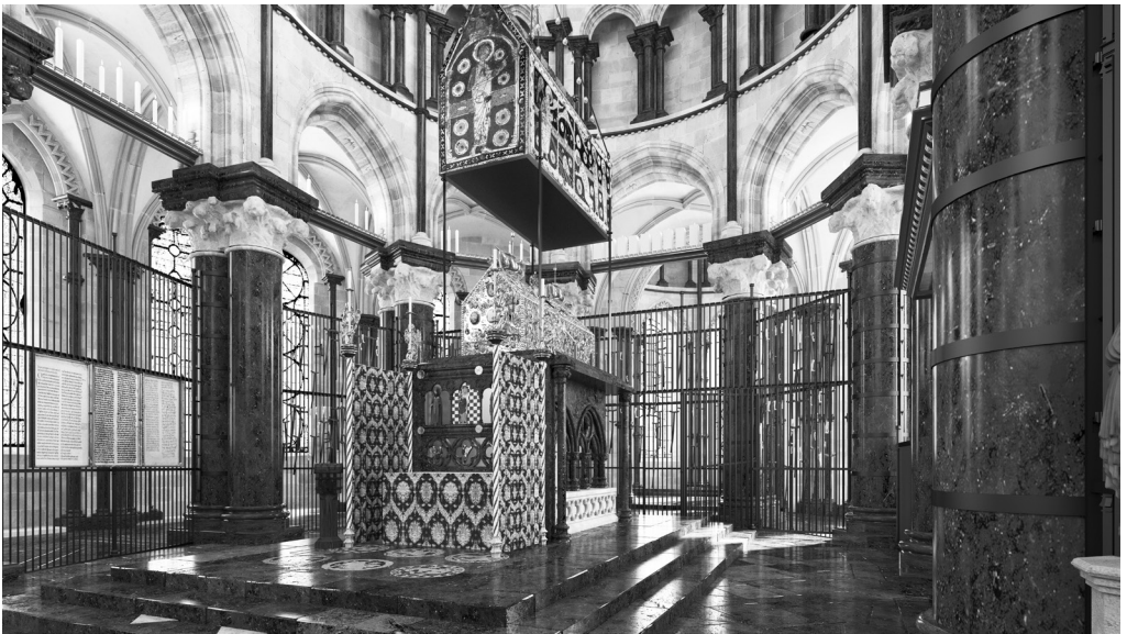
Digital reconstruction of the shrine of St. Thomas Becket at Canterbury Cathedral ca. 1408. Centre for the Study of Christianity and Culture, University of York, 2020.