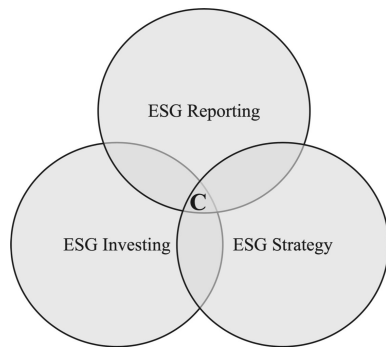
Figure 1: ESG Convergence (own illustration)

In an ideal world , the market participants of the ESG ecosystem would collaborate as outlined below in the joint pursuit to maximize the Convergence of ESG ('C') in the illustration above. The following abstract briefly explains the (ideal) role of every participant in the ESG ecosystem and highlights their respective demand and supply side as well as their core activities for ESG integration.