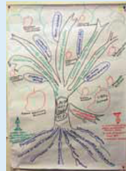
Thushan Kapurusinghe's 'results tree' portrays many complex ideas at a glance. (UNV)

Effectively, the ‘tree’ distils a four-page report into one simple and easy-to-absorb image.