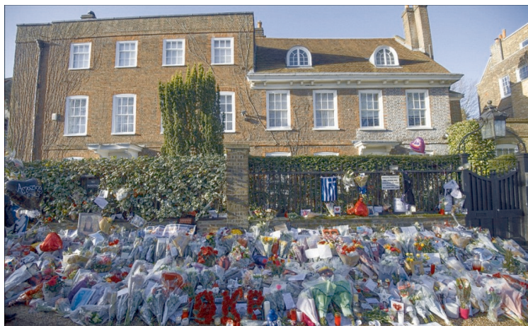
Fig. 1: A place for mourning in front of George Michael's house in Camden, London. 5

The example of George Michael's grave shows how the Trust regulates the cemetery's practices and usages. Obviously there is a private part in West Highgate that is not open to the public. The relatives' wishes may have formed part of the decision to make the grave non-accessible for visitors. But in addition the Friends of Highgate probably feared West Highgate Cemetery might become swamped by mourning fans, by their tributes and ultimately turning it into a place of mass pilgrimage as is the case with other tombs in East Highgate notably the grave of Karl Marx. 4 The Trust argues that there is not enough space to receive the tributes, which, on the one hand, is a little surprising given the spatial dimensions of the cemetery. On the other hand, however, the policy might be deemed reasonable remembering the pictures in the press of the huge piles of flowers, letters, candles and pictures among other things in front of George Michael's house in Camden (fig. 1).