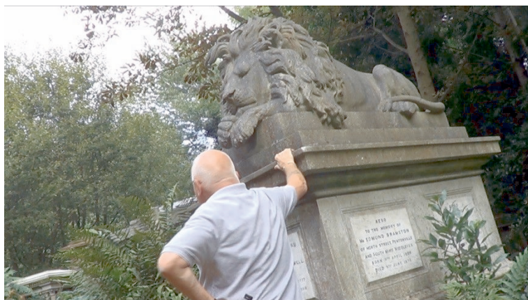
Fig. 10: The tombstone of George Wombwell with the lion Nero sleeping on the top of a sarcophagus.

they are often not directly connected to the materiality of the cemetery and could also be told on another occasion at a different place. In this way the narratives enlarge the cemetery's geographical space with the life stories of the people buried there. These stories are complemented with personal stories of the tour guide. For example in front of the grave of a person who recently passed away, Alexander Walterowitsch Litwinenko, member of the KGB, he mentions: «...they put some radioactive stuff into his tea, uhm, a lot of people say, was he safely buried here? He is, because it was a substitute of Pollonium 210...» 41 The TG tells his personal story about an Arsenal football game he attended where they had to close a whole section of the football stadium. The deceased was at a game in the same stadium before he died and according to the TG they feared «some radioactive stuff» in this section. By sharing these personal stories the TG connects successfully with the Ps.