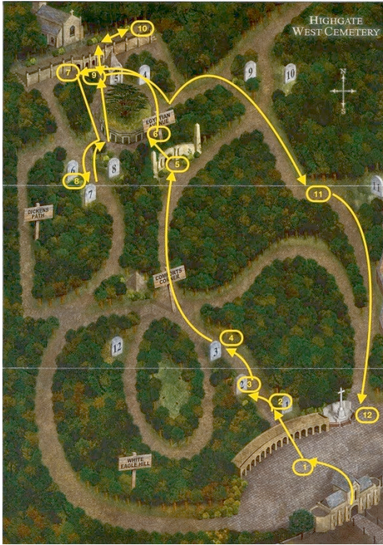
Fig. 8: The map is pictured on the back of the flyer that is distributed at the entrance to the cemetery (Image: Marie-Therese Mäder 2017).

The applied method of gathering data in the field and later interpreting it evaluates how the tour shapes the reception of the cemetery. The data is analysed by a combination of two approaches namely sociological hermeneutics of knowledge and grounded theory. 26 The analysing process has been adapted to the collected data of the field notes and is divided into three steps. 27 In the first step the audio recording has been transcribed. Next the transcribed text has been extended with the photographs namely the photos have been assigned to the text so that text and images are synchronized in space and time. Finally, the text has been divided into different kind of actions accomplished by the TG and the Ps. This included ver-