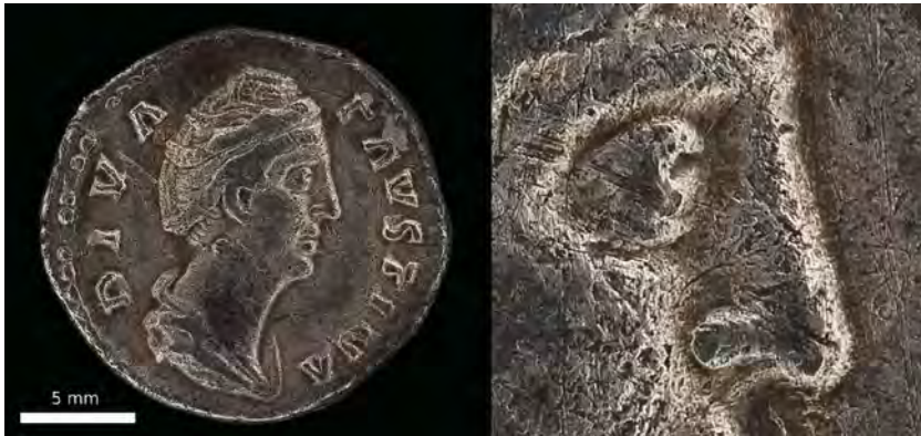
Figure 15.1. Focus stacking record of a Roman coin.