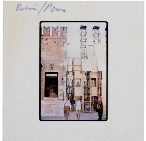
Fig. 34. - Fig. 35. Aldo Rossi's entrance gate to the Arsenale for the first Venice Architecture Biennale, "The Presence of the Past," 1980. Photograph: Charles Jencks. Courtesy of the Jencks Foundation at The Cosmic House.