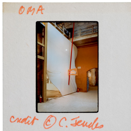
Fig. 39. - Fig. 40. Façades by Frank Gehry and OMA (Rem Koolhaas), "Strada Novissima," first Venice Architecture Biennale, "The Presence of the Past," 1980.