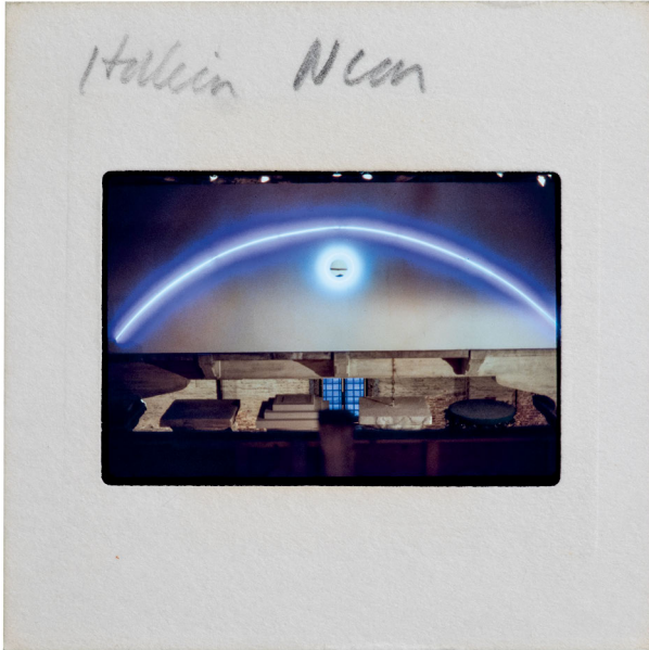
Fig. 33. Fragment of façade by Hans Hollein, "Strada Novissima", first Venice Architecture Biennale, "The Presence of the Past," 1980.