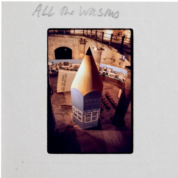
Fig. 36. - Fig. 37. Charles Jencks, Critics' Corner installation, "All the Wasms have Become Isms", first Venice Architecture Biennale, "The Presence of the Past," 1980.