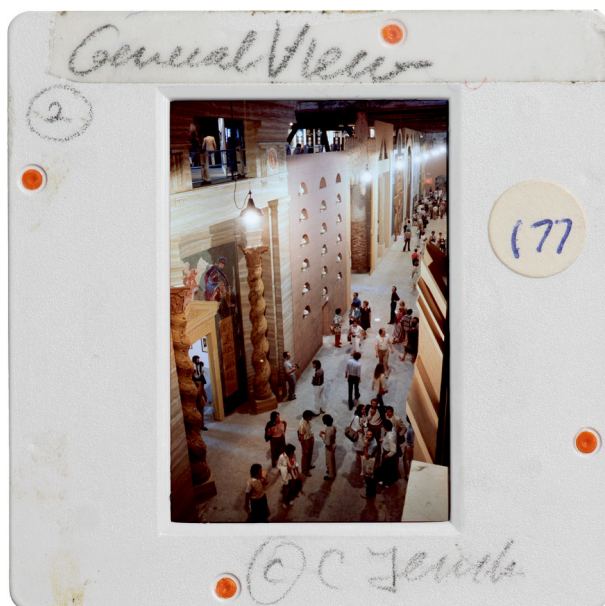
Fig. 38. "Strada Novissima" installation inside the Arsenale, first Venice Architecture Biennale, "The Presence of the Past," 1980.