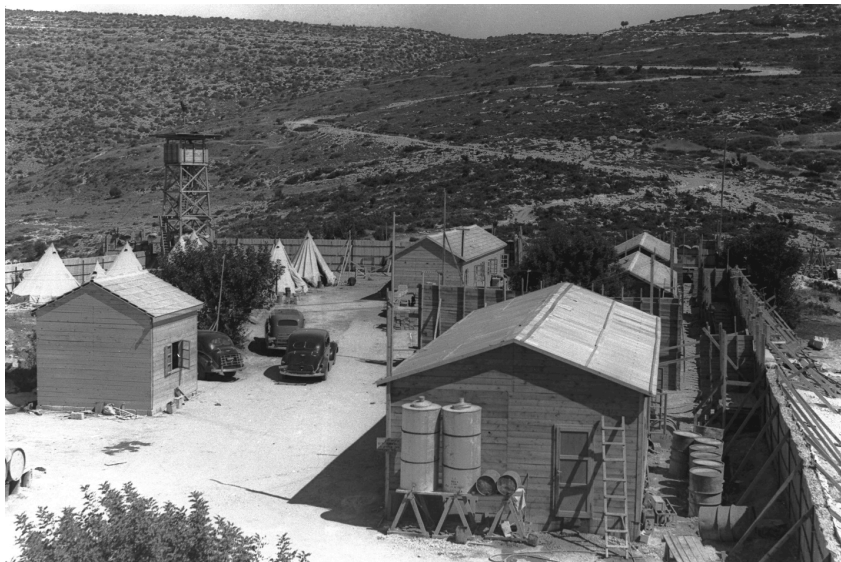
Photo: Kibbutz Hanita in the Western Galilee 1938