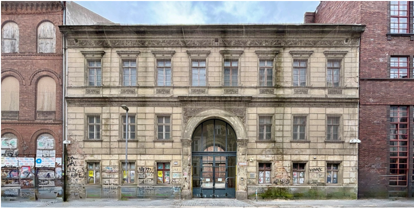
Photo: The Ahawah Home in Berlin, Auguststraße, nowadays