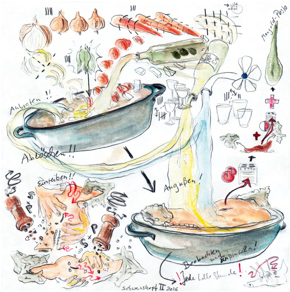
Fig. 4: Pig's head II, 2016, pencil, crayon, watercolor and acrylic on paper, 20 × 20 cm