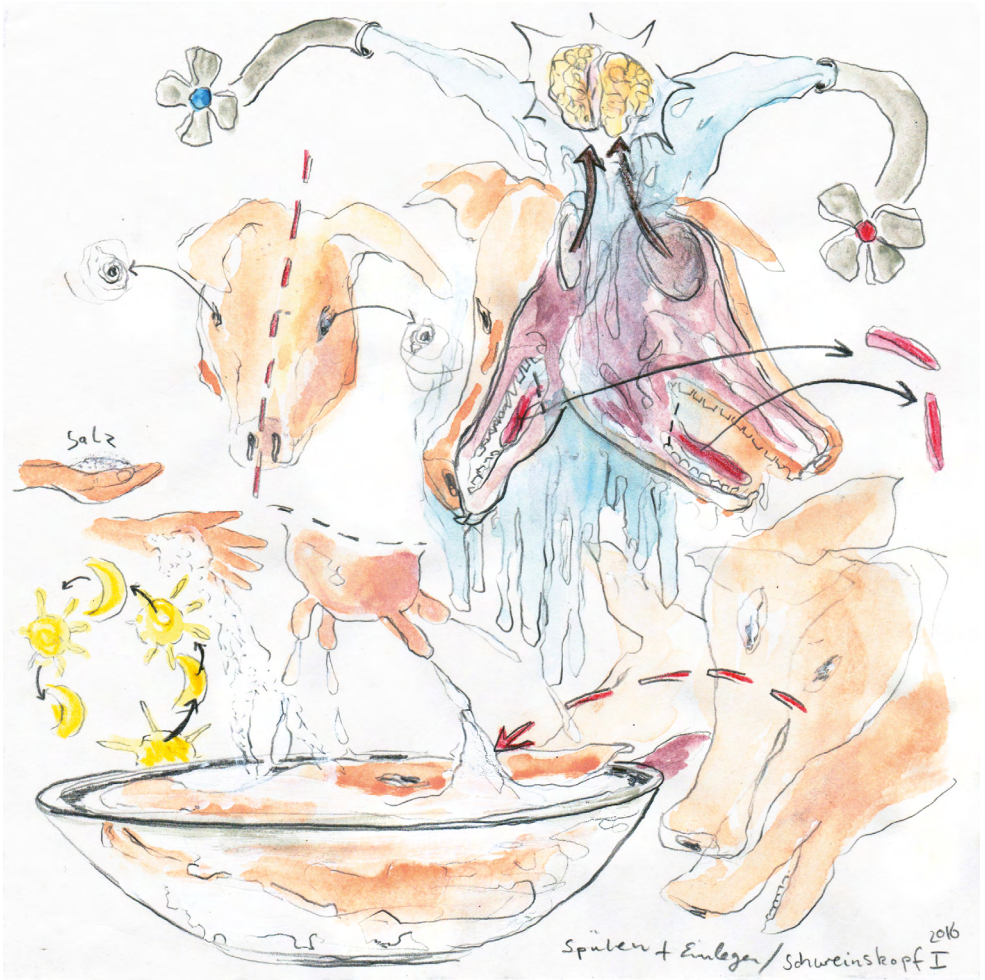
Fig. 3: Pig's Head I, 2016, pencil, crayon, watercolor and acrylic on paper, 20 × 20 cm