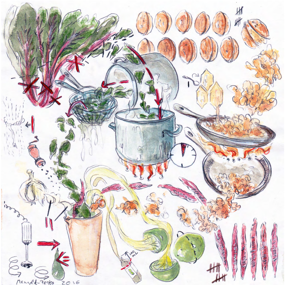
Fig. 2: Chard pesto, 2016, pencil, crayon, watercolor and acrylic on paper, 20 × 20 cm