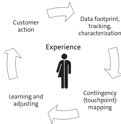
Figure 1. The “ experience programming loop ”, whereby the temporal and spatial distance between customer action, data footprint and tracking, contingency mapping, and learning is narrowing, given the mainstream digital touchpoints of the customer journey, and the ongoing digital transformations, such as those in mixed reality, IoTs, AI-power technologies, and Web 3.0.

First, many entities are competing for customers' attention in a manner that is systematic and therefore may influence the attention that customers may be able to place on their own life's journey 1 . Second, considering that our experience journeys are increasingly digitised, that is, they involve multiple digital touchpoints and digital transformations (e.g., Hoyer et al., 2020; Petit et al., 2019), we are witnessing what we have coined the “ experience programming loop ” (see Figure 1 ). Through this concept, we suggest that the temporal and spatial distance between customer action, data footprint and tracking, and contingency (touchpoint) mapping, is narrowing. In one way or another, this means that our experiences can, at least in part, be digitally programmed, potentially, with increasing precision over time.