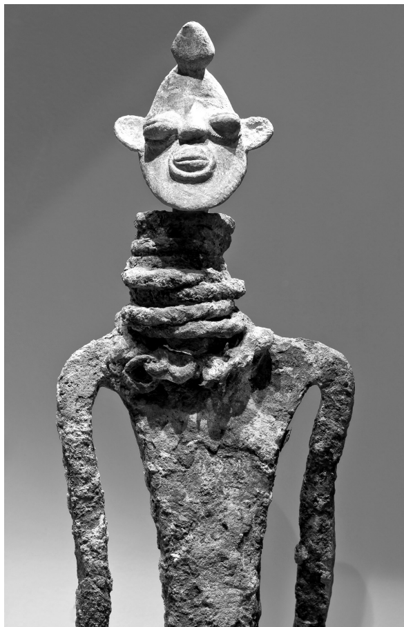
Fig. 5: Metal figurine.