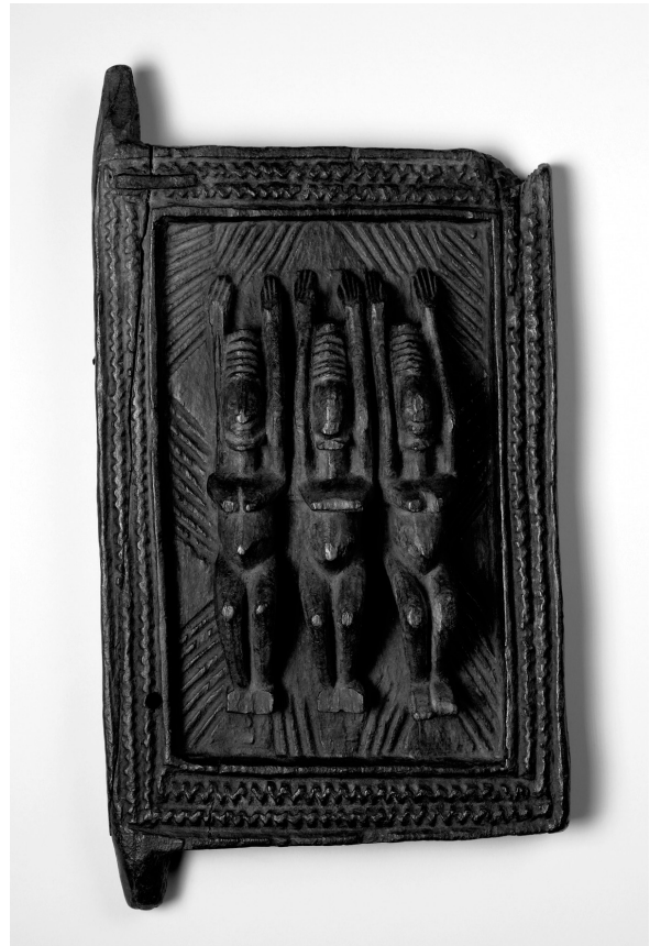
Fig. 3: Door depicting three women.

And this is the crux of the matter. Dogon culture is changing and the religious conversion plays a critical role in this process. In the first place, as Islam does not tolerate visual representations, the Dogon sculpture and metallurgy is perhaps not disappearing but undergoing a change of function – they are becoming a source of income in the global market. The Muslim conversion of villages and