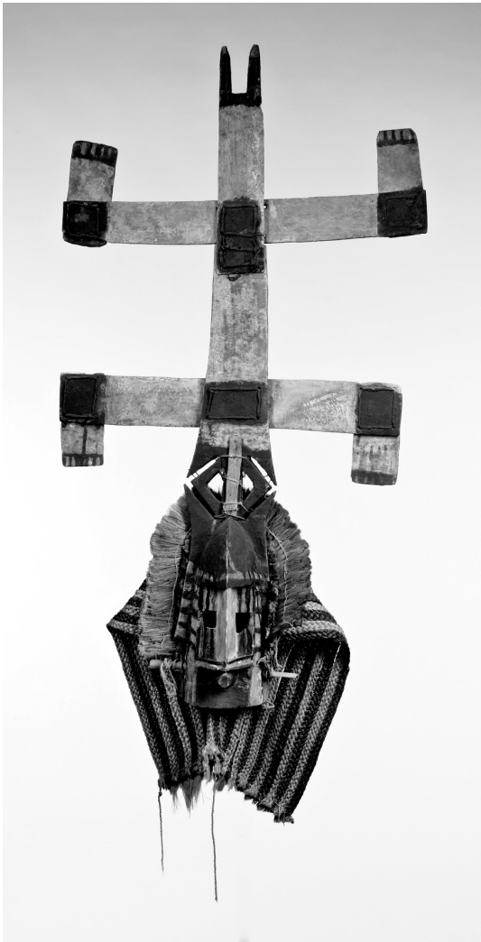
Fig. 2: Kanaga Mask.

The remaining sections of the exhibit contain examples of Dogon metallurgy and textiles. The cast metal figures and other objects demonstrate technical and artistic skills of Dogon blacksmiths, who used a lost-wax technique in order to create small but solid figurines (Fig. 5). Similarly, the cotton textile making, which according to one Dogon myth dates back to the third day of creation, has a long tradition among that people. Still, in comparison with textiles of some neighboring peoples, such as the Fulani, Dogon items display rather limited means of artistic expression, although the meaning of some traditional patterns fits neatly within the Moslem worldview that is being adopted by increasing numbers of the Dogon.