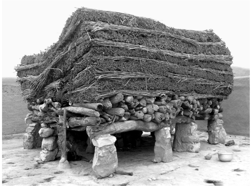
Fig. 4: Toguna in Sangha.