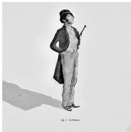
Figure 1: Le Flâneur

The later attribution is the one that might be interesting in contemporary discourses: the flâneur as an artist, an actor, and a writer. Let us go back to Garvin’s little image.