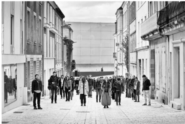
Figure 2: Walking the City, Poitiers

gazing only at the sky and interpreting the clouds; finally, I advance with my eyes closed. As I walk, I link the locations I have passed through – the places of the past – into a network that potentially contains future places. I experience this space and the way the past flows through the present moment into a future. A space defined by temporal and social coordinates takes shape. Led and guided by the voice from the radio, my body and my movements, evidently less smooth and more halting than just a couple of years ago, become an instrument for measuring this space-time experience. Finally, the voice leads me zigzagging from one side of the road to another. I rebound through the streetscape marked out by my experience like a rubber ball, until I am instructed to bring my solitary excursion to an end. Filled with my newly-detailed knowledge of the streets of Spalenberg, I return the radio receiver.” (Schipper 2014b: 27) 5