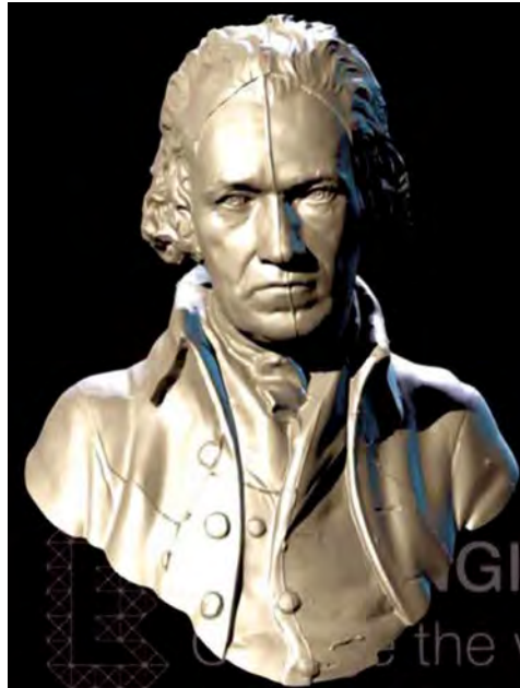
Figure 12.1. Virtual Reality display and 3D printed replica from 3D scan of a negative cast form.

Non-contact 3D imaging methods and 3D printing were used to produce a physical replica of the original "negative" plaster-cast form, dating from around 1807, which was found in the workshop of the engineer James Watt. It was paramount for the conservation of the original to use a non-contact method so as not to disturb the material and surface inside the mould. The form was complex, composed of four main pieces containing a total of twenty-nine separate sub-pieces. 3D colour laser scanning was used to record the plaster cast with a sampling grid of 0.1 mm. The digital 3D models of the components of the cast form were aligned and the surface normal directions were inverted to create a positive surface model. The result was a first image of the cast and was immediately recognized by the curator as a previously unseen portrait