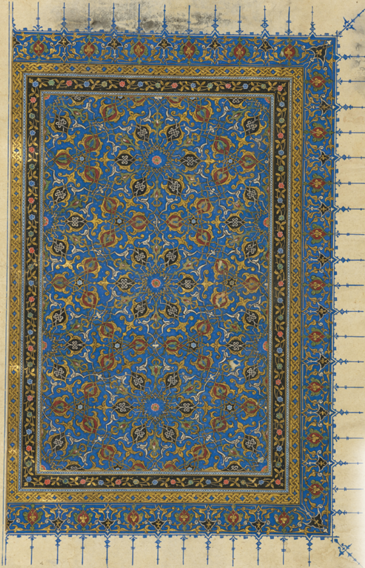
Figure 20.4. Double-page illuminated frontispiece, Collection of Traditions (Jāmi' al-uṣūl li-aḥādith al-rasūl) , Majd al-Dīn ibn al-Athīr (d. 1210), text copied by Muḥammad ibn Ḥājji al-Ḥāfiẓ, Timurid Shiraz (Iran), Ramadan 839H (March 1436), CBL, Ar 5282