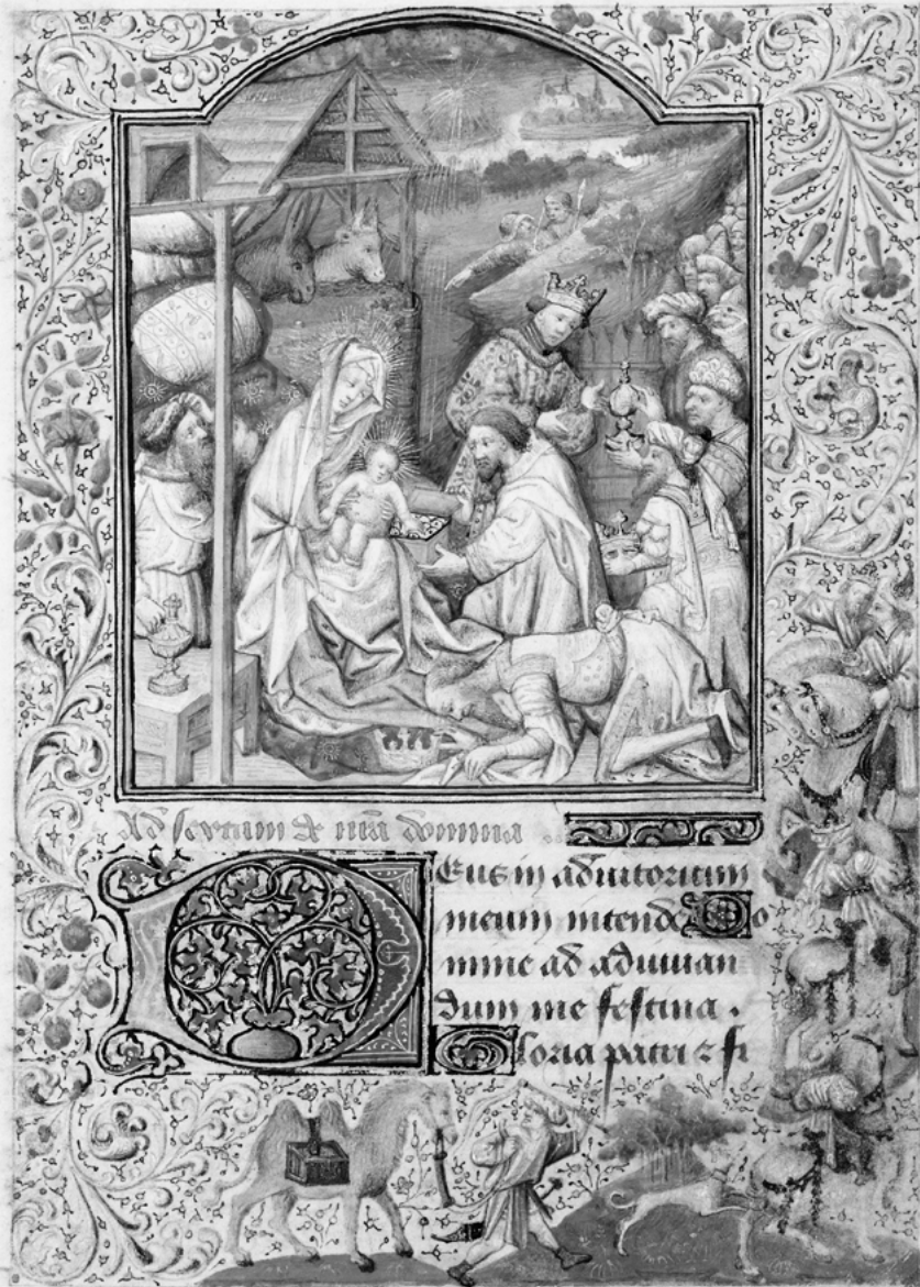
Figure 20.2. Adoration of the Magi, Coëtivy Hours, attributed to the Dunois Master, 1443–1445, Paris, CBL, W 082, fol. 53 © Trustees of the Chester Beatty Library. Courtesy of the Trustees of the Chester Beatty Library.