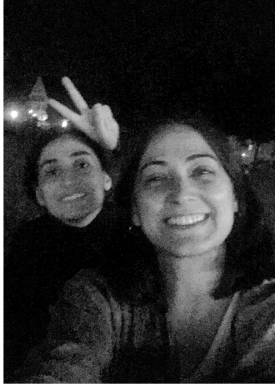
Figure 1: Selfie after a rehearsal for Dansöz (2019, Basel/Swiss)