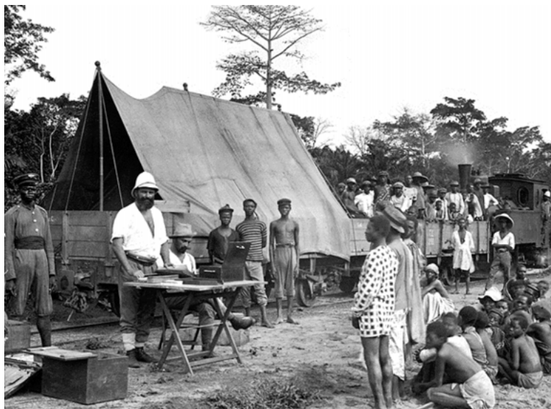
Figure 4: Few pictures incorporate the “colonial idea” more thoroughly than this photograph from the Simon Collection. Unlike the greater part of this corpus of pictures on glass plates, this picture is contained in a small album and only exists as a paper print. Judging from the other pictures in the album, we can estimate that it was not taken by Simon himself, but was bought from Alex Acolatse’s studio (David 1992). Part of Acolatse’s business was to sell photographs of the colony to the Germans before they returned to the homeland. These were readymade as prints on paper and arranged in an album. The habitus of brevity represents the affirmative attitude toward the iconographically composed pictorial elements: the steaming train in the background as a sign of modernism, the distribution of money (the compulsory workers received a so-called “food allowance”), the police violence in the background (on the very left side in the picture) and the dress code, showing the Europeans in white clothing and the Africans mostly half-naked. The only detail that disturbs this affirmative harmony is the bored gesture of the seated European, who obviously has no active part in this scene. Presumably, it is Simon himself.