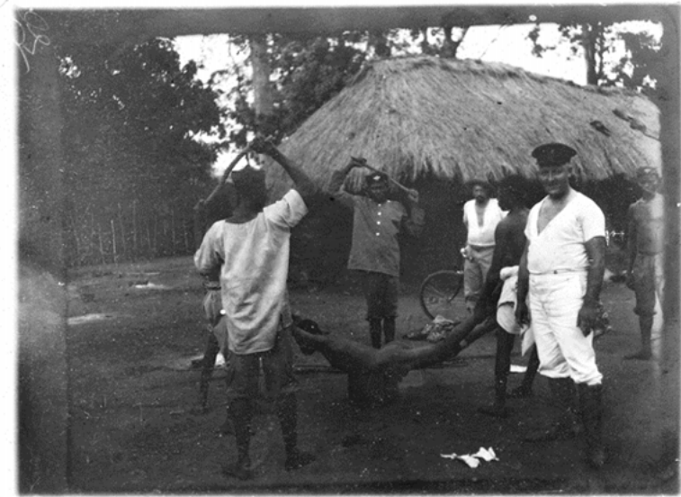
Figure 2: This picture belongs to the private collection of Dr. Rudolf Simon, who was a government physician in Togo 1910–14. His primary responsibility was taking care of the “compulsory workers” (Pflichtarbeiter) during the construction of the Togo railway (Hahn 2004d, 2007). His collection of photographs, today housed in the museum of local history (Heimatemuseum) in Zusmarshausen, comprises mostly private photographs that more or less represent the non-official side of everyday colonial life. The scene depicted here – the beating of a Togolese man with short segments of heavy rope – apparently required the presence of the public health officer. In other words, witnessing these punishments was part of his official duty. And yet, the picture is not an official self-portrayal. The intensity of the violence depicted causes the picture to contradict the self-defined image of Togo as an ideal colony. It is actually a very rare picture.

Chaudhary (2005) calls this a “phantasmagoric aesthetics” – a fascination for horror that is able to portray boundless violence in such a cool and distanced manner only because it is attributed to the “other”, the colonial subject. Total control of the body belongs to this phantasmagoric idea of control. The emotions on the people’s faces reflect an absolute distance from the scene. Coombes (1994) discusses similar reproductions, including a scene photographed immediately after the destruction of the palace in Benin City. In the middle of the ruins, a colonial officer sits in a casual pose. In front of him are the palace’s art treasures that soon will be confiscated as war booty.