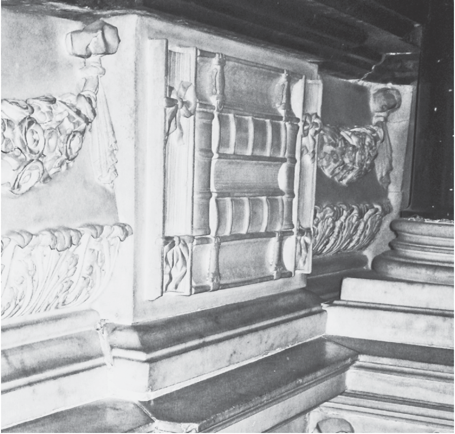
Figure 22.4. Grinling Gibbons. Tomb of William Cavendish, 1st Duke of Newcastle and Margaret Lucas Cavendish, Duchess of Newcastle (detail). Before 1676, marble. Westminster Abbey, London.

female kin. In life, Margaret used text in lieu of the “stately Monument” to support her family’s claims to land, status, and power. In death, funerary architecture works to physically insert her writing into the symbolic heart of social and political power (Figure 22.4).