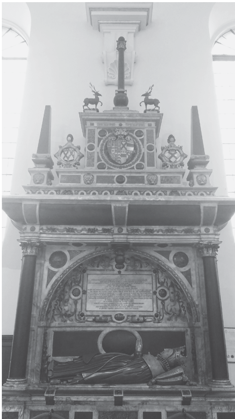
Figure 22.1. Robert Smythson. Tomb of Elizabeth Talbot, Countess of Shrewsbury (Bess of Hardwick). Ca. 1601, alabaster. Church of All Saints (Derby Cathedral), Derby. Eva Lauenstein.