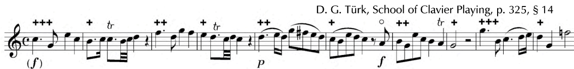
Ex. 101: D. G. Türk, School of Clavier Playing , p. 325, § 14 (metrical grouping of bars)

Necessary though it is, in accordance with the above-mentioned rule, to place an emphasis on the first note of a section or phrase, the following qualification is also important: only the first tone that falls on a strong beat must be so stressed. The a marked with ° in bar 6 should therefore not be struck as strongly as the following b , although that section as a whole should be played more strongly than the preceding one. Failures to observe this qualification are frequent: for a first note marked forte that is only transitory is often played as loudly as the following one that falls on a strong beat.