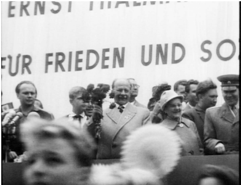
Fig. 5: The gulf between image and voice over: “But the reality looks different.”