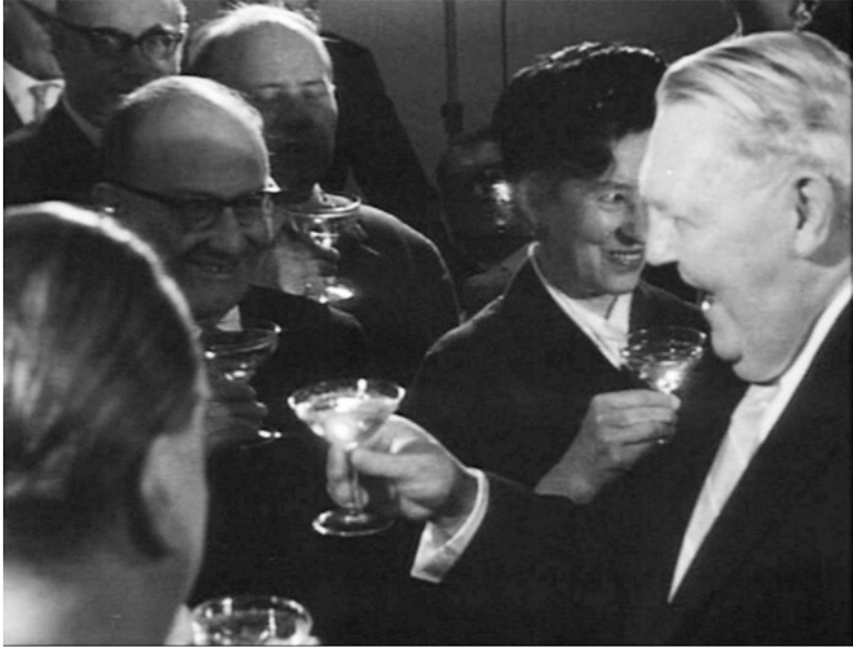
Fig. 7: “The result of wise and consistent economic policy [...], let’s drink to that”.