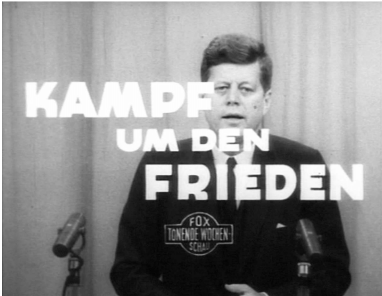
Fig. 1: The own: “The struggle for peace”