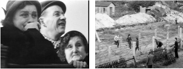
Fig. 8 & 9: The suffering: women weeping at the border (left) and spectacular escape attempts (right).