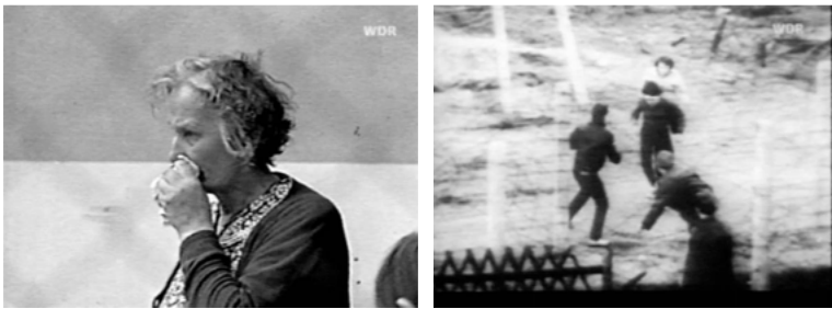
Fig. 10 & 11: Persistent interpretation nearly 40 years later: women weeping at the border (left) and spectacular escape attempts (right) restaged in 1999.