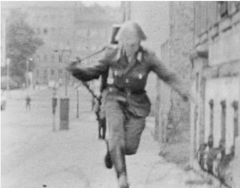
Fig. 6: “With courage and despair he broke through the barbed wire“