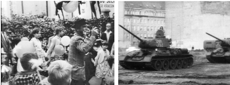
Fig. 3 & 4: In the west: "Everyone is happy and gay" (left) and "Tranquil parks become the deployment zone of Soviet tanks" (right).

Sources: DAS WAR 1962, Beitrag 38 'Ein Jahr danach – Die Mauer' (left), DAS WAR 1961, Beitrag 38 'Aufmarsch in Ostberlin' (right).