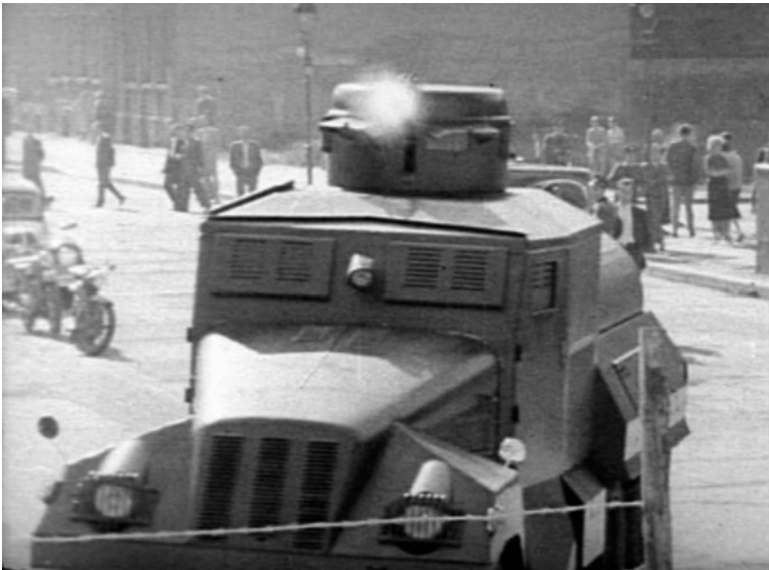
Fig. 2: The alien: "This is what the workers' paradise looks like"