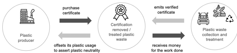
Fig. 8: PC cash and certification flow (own adapted illustration based on TonToTon 2022; icon source iconfinder & flaticon; credits to Freepik; Eucalyp Studio)

ery or even landfilling on a sanitary landfill. Optimally, sufficient money will also be raised to help finance future waste management infrastructure in the country where the PC project takes place (cf. Prevent Waste Alliance 2022c: 5). Using quality standards regarding social and environmental requirements can lead to diverse benefits (e.g., via “(...) creating socio-economic co-benefits by improving income opportunities for waste workers.” (Prevent Waste Alliance 2022c: 2). Following this basis idea PC therefore address the Polluter Pays Principle by shifting the cost towards producers and promotes the internalization of negative externalities like the EPR system do (e.g., waste management costs) (cf. OECD 2016: 21; see also chapter 2.3).