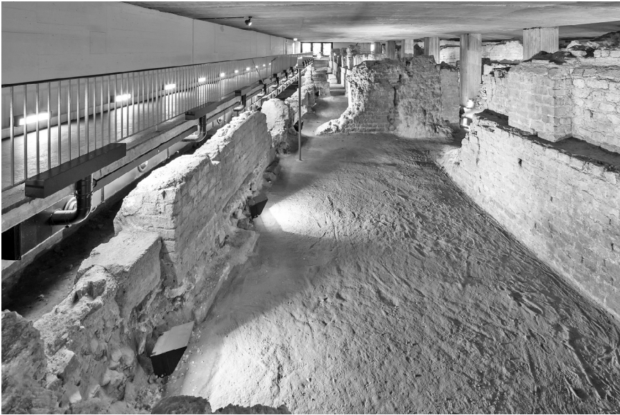
Figure 8.2. The archaeological remains of the Roman Praetorium in Cologne.

almost no textual description nor interpretation, the monument's impact can effectively assert itself in this ambience.