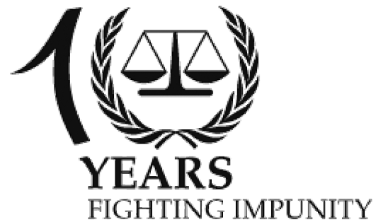
Figure 2: ICC’s 10-year anniversary logo 7

(e.g. Trotter 2012) and victim participation. Moreover, the Court is at the heart of what is commonly known as the ‘peace versus justice’ debate. While critics argue vociferously that aspirations towards justice in fact impede the realisation of sustainable peace, there is no unequivocal evidence to suggest that the ICC has definitely undermined or frustrated peace efforts and has had a deterrent effect. In light of legacy building, the resultant ambiguity is difficult to navigate for the Court.