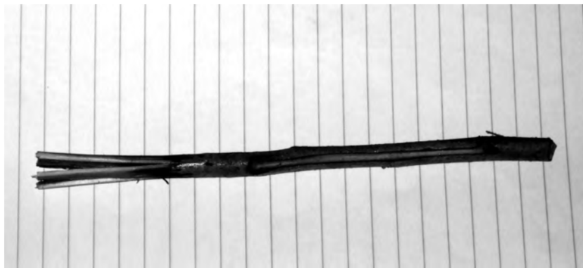
Fig. 14: Dead body (When associated with no-through-way ). Simulacrum: stick with frayed ends (16.5 cm). Icon: fork. Index: eating.