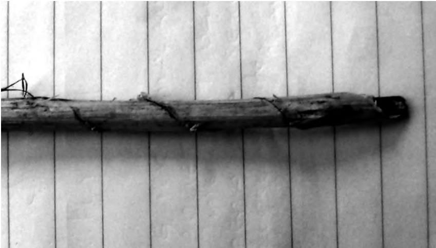
Fig. 17: Hurry. Simulacrum: stick with sharpened end and spiral carving (36 cm). Icon: speediness. Index: unclear.