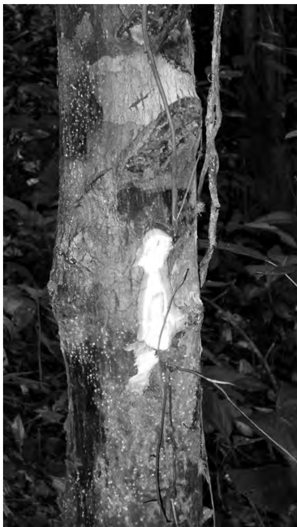
Fig. 7: Oval shaped carving to the right of the path.

the Western Penans of Plieran as: “Three shaved sticks stuck vertically into the ground to form a fan-shape.”