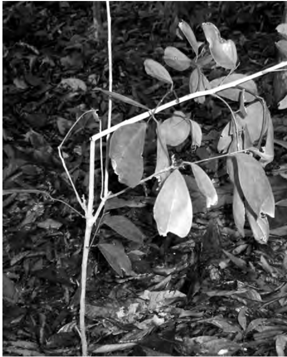
Fig. 19: Take this direction.