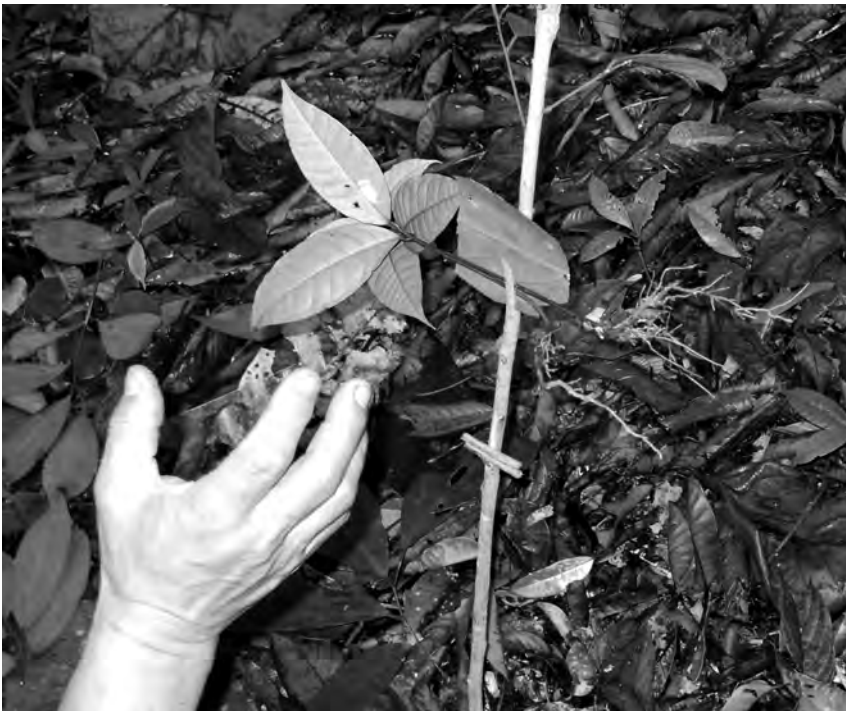
Fig. 11: Upper cleft family tree (30 cm) and empty plate simulacra (12 cm). Lower cleft contains sameness simulacrum (7 cm).

The indexical interpretation of “living” is negated by the interdiction contained in the indexical interpretation “no-through-way.”