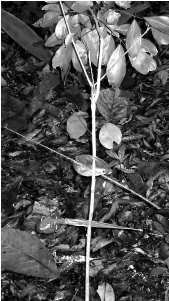
Fig. 9: Unsuccessful hunt; gone to the river to fish.

Message 1: “Successful hunt; have barbecued meat and soup. We are over here.”