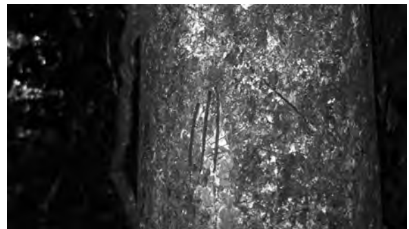
Fig. 22: Do not fell this tree.