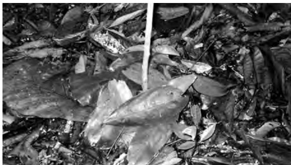
Fig. 20: Wait here for me.