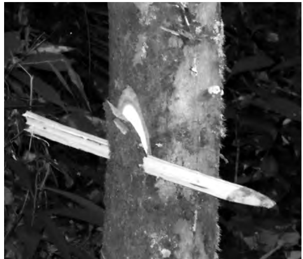
Fig. 2: I will fight/kill you. Simulacrum: knife-shaped stick (27 cm). Icon: parang knife. Index: stabbing/killing.