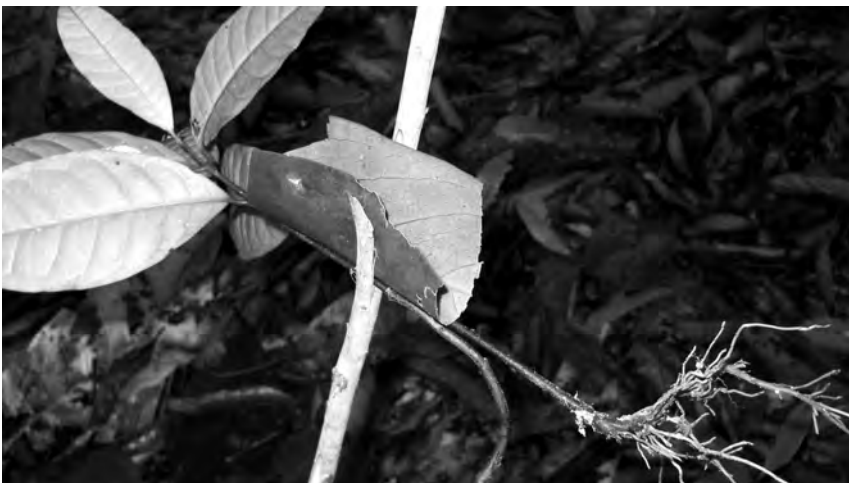
Fig. 18: We are two families. Simulacrum: uprooted sapling. Icon: family tree. Index: family.

An uprooted sapling (approximately 30 cm high) placed horizontally in a cleft represents one family. In Figure 18 two uprooted saplings are placed next to an empty folded leaf indicating that two families left this message. The empty-plate simulacrum further indicates that hunting was unsuccessful.