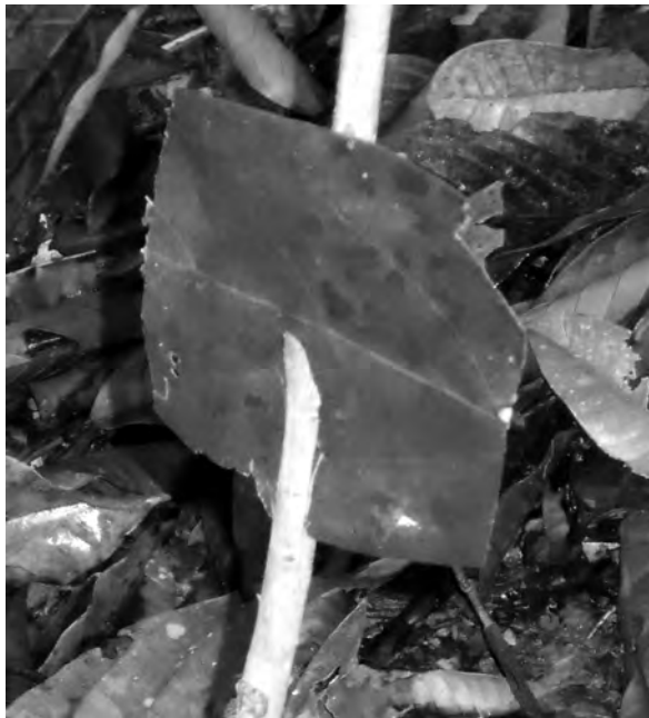
Fig. 1: Hunting unsuccessful. Simulacrum: leaf cut in oblong shape (12 cm). Icon: empty plate. Index: no food.