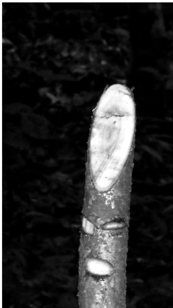
Fig. 6: Face carving.

These barriers are accompanied by sameness simulacra if the message is for other Penan or differentness simulacra if it is destined for other ethnic groups. The parang simulacrum can also be accompanied by the manacle simulacrum indicating that trespassers will be punished or fought (Fig. 8). Chen (1990: 22) described a similar barrier used by