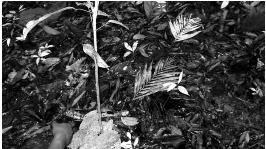
Fig. 3: Take this direction.

barriers, large tree trunks. Arnold (1958) and Chen (1990) also illustrated indexical simulacra manufactured from sticks implanted into the ground. These are listed in table 2 along with the indexical simulacra described by the informant.