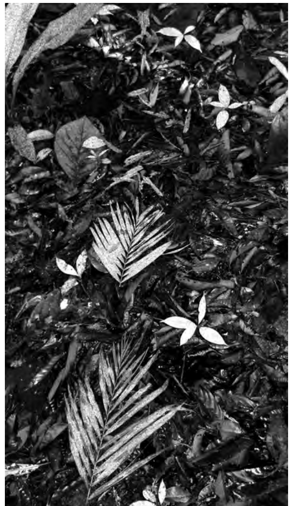
Fig. 10: Don’t take this direction.

Larger leaves followed by smaller leaves [simulacrum] – path petering out [icon] – no-through-way [index]; “Don’t go in this direction.” [message] (Fig. 10).