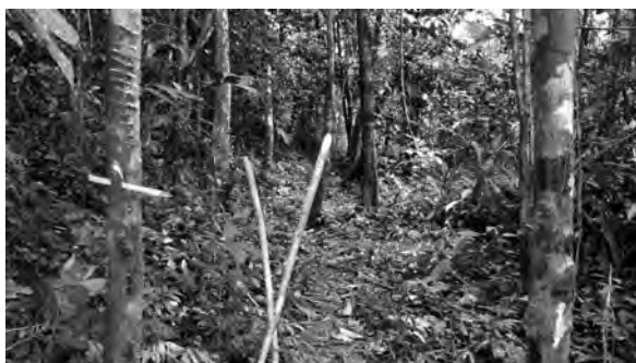
Fig. 5: Parang simulacrum and crossed sticks.

function to demarcate areas and warn people that no hunting or planting is allowed. They were much more complex than the other indexical simulacra and included iconic simulacra and bark carvings that conveyed interdictions and threats. The barrier