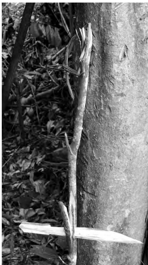
Fig. 8: Manacle simulacrum (18.5 cm) in top cleft associated with parang simulacrum (27 cm) in lower cleft.

Quantifying simulacra consist of two sticks of different lengths that can be compared to indicate distances travelled and distances to destinations. How much of the journey is left to be completed is estimated by comparing the difference in lengths between the implanted sticks. The informants did not mention these kinds of simulacra; however, Arnold (1958) and Chen (1990) both provided detailed descriptions. Table 3 lists numeric and quantifying simulacra. Interpretations of these simulacra were