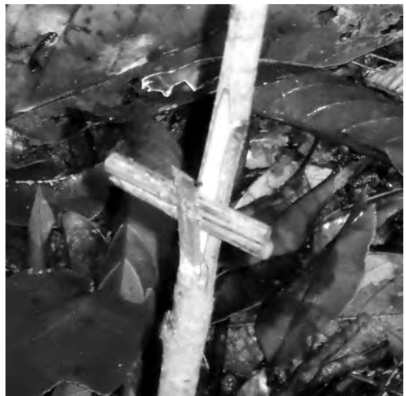
Fig. 16: This is a message only for Penan. Simulacrum: two short sticks of the same length (7 cm). Icon: sameness. Index: same tribe.