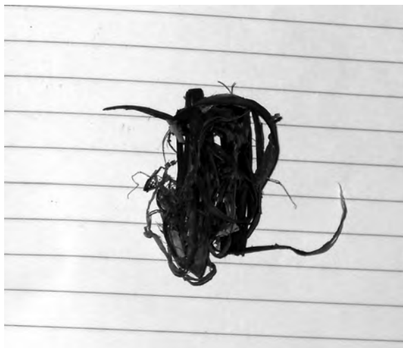
Fig. 15: Someone is ill and needs help. Simulacrum: bundle of vines (8 cm). Icon: medicinal herbs. Index: sickness.