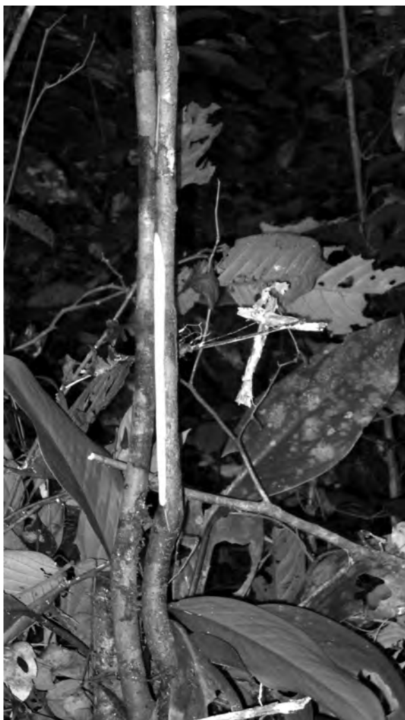
Fig. 4: Elongated oval carving.