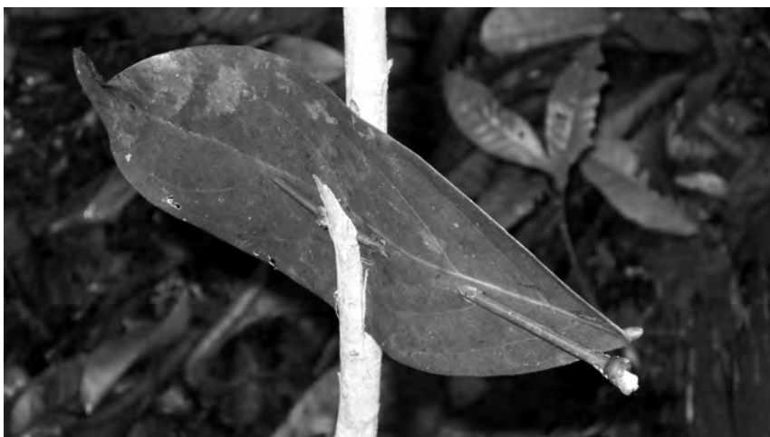
Fig. 12: Successful hunt. Simulacrum: leaf pierced with leaf stalk (25 cm). Icon: barbecued meat. Index: game.

A piece of wood cut into the shape of a knife (Fig. 2) represents fighting and informs the reader that the messenger is ready to fight. It may be in association with other signs such as the manacle simulacrum to indicate that transgression will lead to a choice between paying a fine or fighting (Fig. 8). The parang simulacrum possibly corresponds to the “piece of wood” described by Chen (1990: 22) also used to indicate molong and deter other people from harvesting trees.