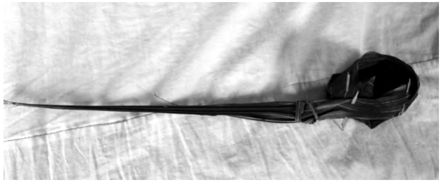
Fig. 13: Soup or River. Simulacrum: ladle leaf shape (30 cm). Icon: ladle. Index: liquid.