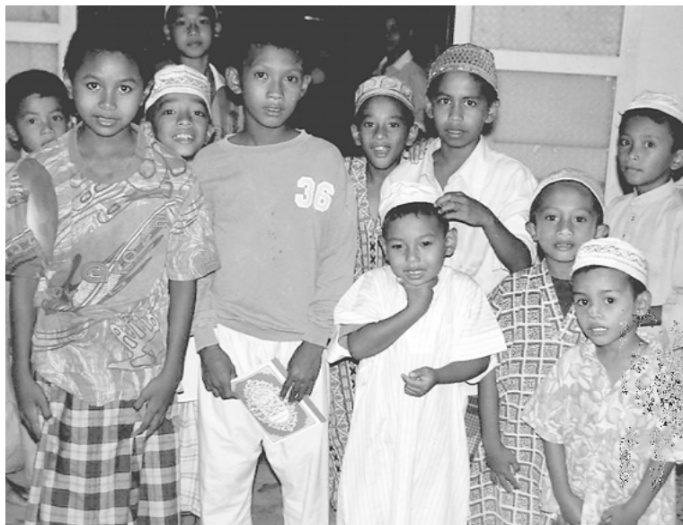
Children at Prayers in Narathiwat, South Thailand.