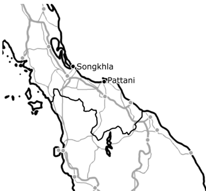
Map 1: Southern Thailand, showing Songkhla and Pattani in the Gulf of Thailand

The present study is concerned with the escalating competition in which cultural concepts vie for hegemony in the expanding local public sphere in Southern Thailand. The aim of the study was to assess recent forms of we-group formation, which seems to be centrally based on the cultural imagination and distinction of the educated middle classes. The transformation of society and culture in Southern Thailand has rarely been explored from this angle. Buddhist-Muslim relationships and identity politics in the 1990s can be interpreted as resulting from