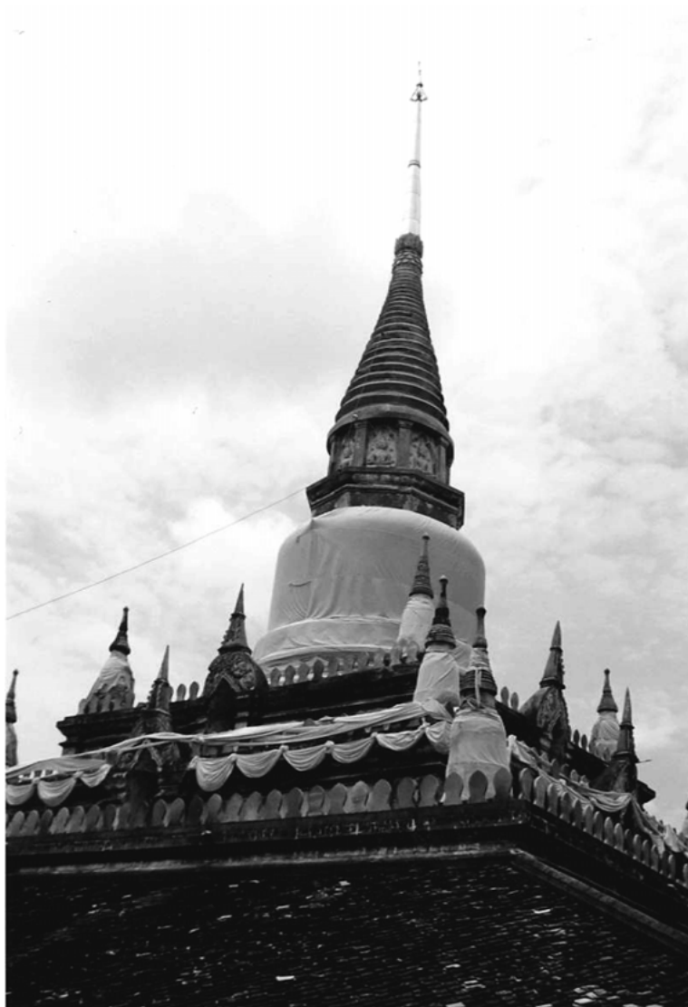
Wat Phra Kho, Reliquia, Songkla, South Thailand.