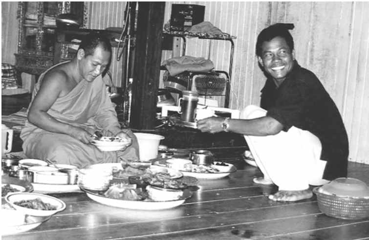
Giving Alms in Kelantan, Malaysia.