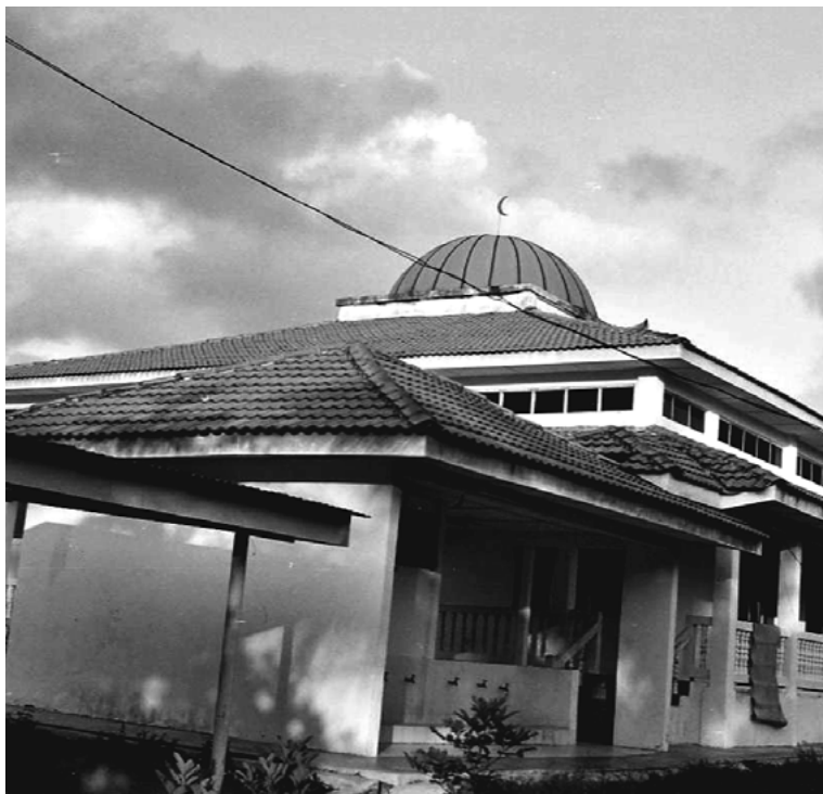
Mosque, Langkawi, Malaysia.