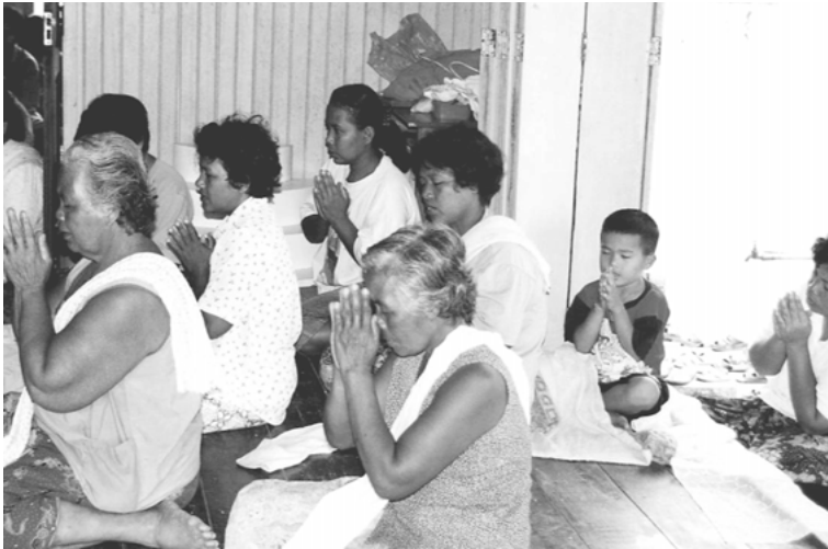
Women Merit Making ( tambun ), Kelantan, Malaysia.

include stereotypes and rhetorical attacks against the Thai Buddhist. The mediation of the public sphere by the public heroes to the global Arab Islamic public sphere is very desirable for the articulate Malay-Muslim middle class. Furthermore, solidarities to the governing PAS in Northern Malaysia and friendships between charismatic religious leaders on both sides of the Thai-Malaysian border are established.