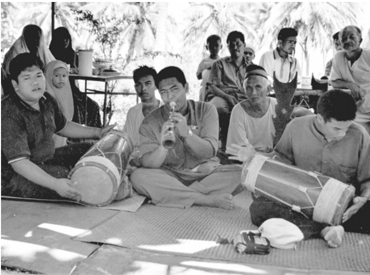
Playing for a Muslim Wedding, South Thailand.

The manifestation of Muslim identity reflects the symbiosis of the Thai government and the Chinese bourgeoisie, the concentration of the economy in the hands of Sino-Thai entrepreneurs and the marginalization of the Malay Muslim people. Second, it shows that the construction and revitalization of identity narratives are themselves a political action. Globalization facilitates the flow of religious and ethnic identity in many ways and puts the the borderland and the revitalization of identity in a new spotlight. Far from being new, religious identities are the product of century-old struggles.