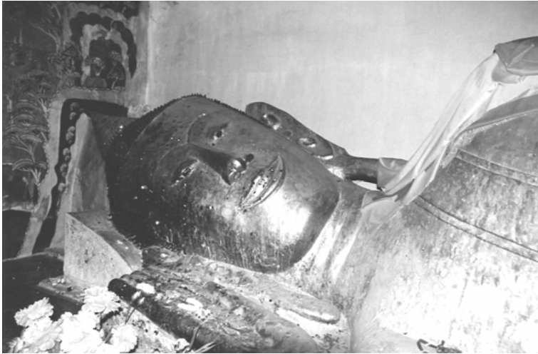
Reclining Buddha, Wat Sathing Phra, Songkla, South Thailand.

the meaning of childhood and of the meaning of parent-child relationships.