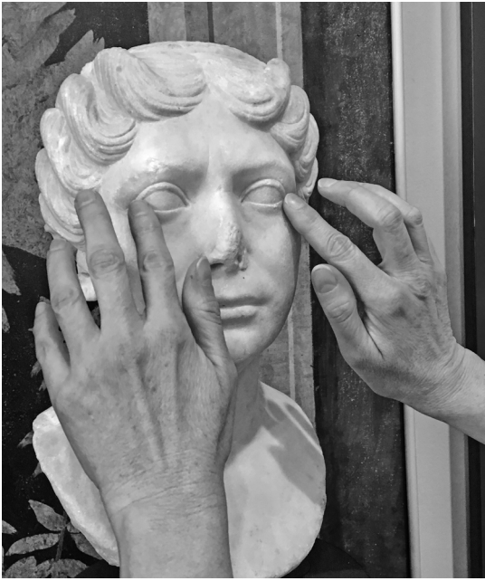
Figure 6.3. Hands reach to touch a marble portrait of a woman, 2014.

As museums shift the paradigm to create inclusive and accessible exhibition environments that are welcoming for everyone, the words of accessibility consultant and researcher Sina Bahram sets the stage. “Accessibility is making sure folks can open the door. Inclusion is inviting people to come inside and enjoy what you have to offer.” 24 I leave the final statement in the capable hands of Blessing Offor, the man who excitedly located the ribs on the iconic sphinx: “License to touch the artifacts is unbeatable. It’s like full immersion; if you want to learn a language you just have to jump into the culture and environment. If you really want to learn about this stuff, you have to go touch it. Even for someone who can see, I think it’s way more valuable to actually be able to put your hands on something!” 25