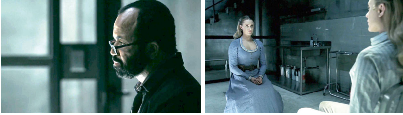
Westworld, S1 E10: The Bicameral Mind, 1:18:34-1:21:27.

It is precisely this identification of programming with one's own voice that the scene under discussion enacts. Accordingly, Dolores realizes that the previously misunderstood, alien images and voices in her dreams are her own memories and instructions – the machine 'unconscious' is reinterpreted as her own inner voice. The video and soundtrack successfully portray the (narcissistic) fascination of this realization. 18 Calmly and confidently, with a knowing look and the hint of an enigmatic smile, her reflection sits opposite Dolores, who recognizes herself in it with a spellbound, tearful gaze. For now she understands all that is incomprehensible and frightening in her life as her unconscious attempt to bring herself to a confrontation with herself. But the moving, emotionally charged staging of this realization also recalls Lacan's insight that subjectivizing identification is always based on a misrecognition. For insofar as programming goes back to Ford and Arnold, the self-consciousness of the hosts is based on a false identification with an alien voice.