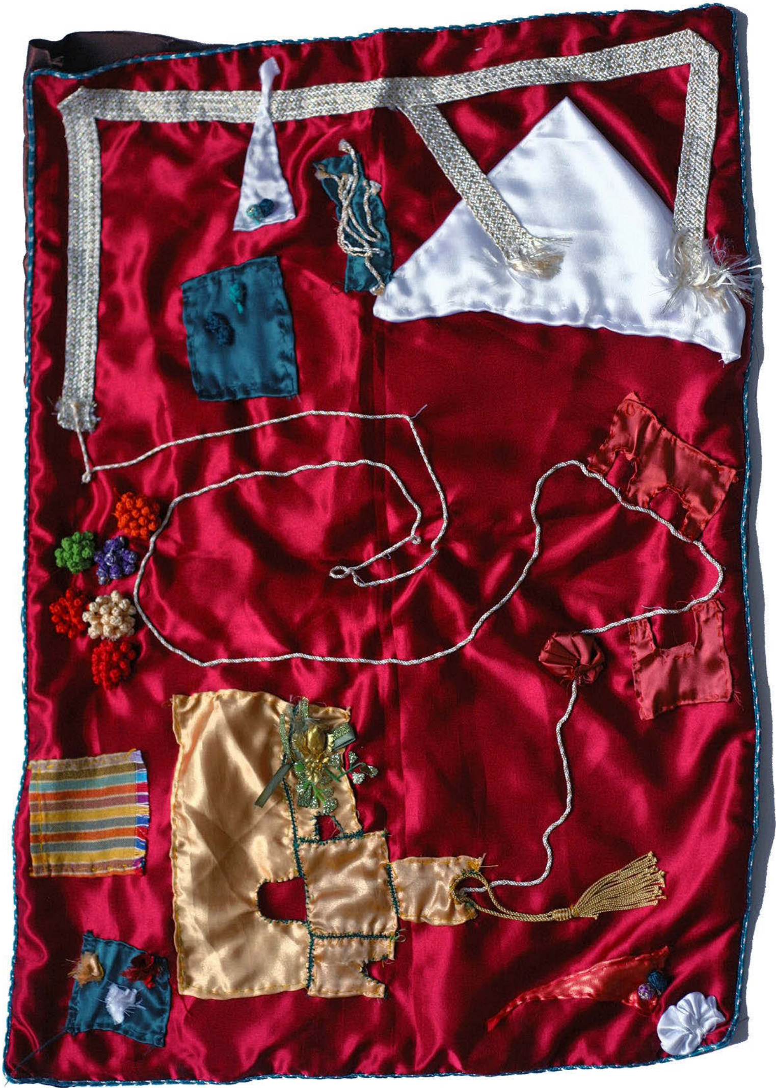
Textile map of Sidi Yusuf.