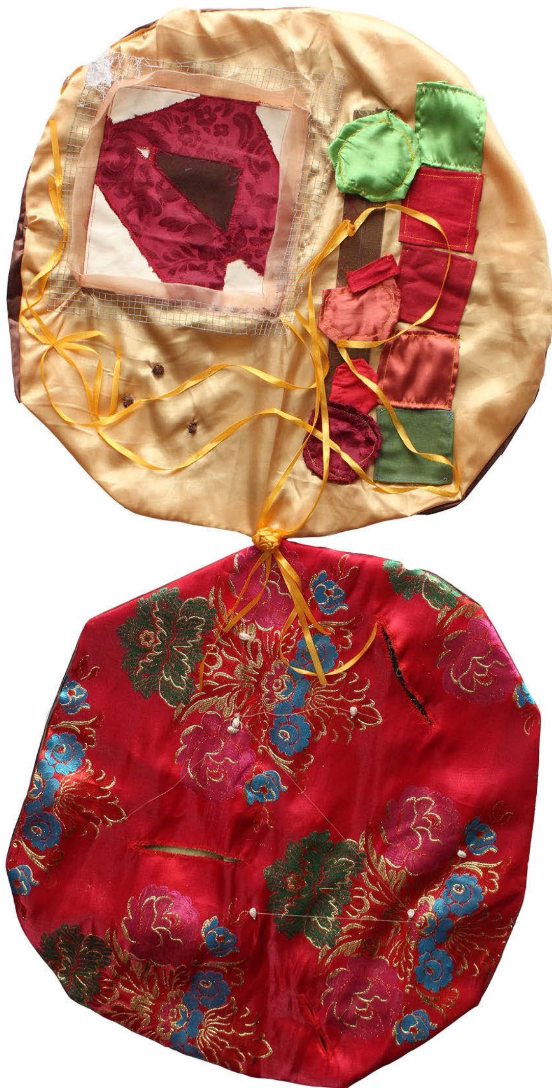
Textile map showing living spaces of women from Sidi Yusuf.