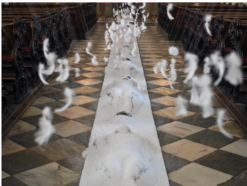
Fig. 4: Elke Maier/Georg Planer, W Erde Licht (2009) in its Easter transformation. artwork © Elke Maier & Georg Planer.

Different from Richter's window, the installation by Maier and Planer reacts directly to the liturgy of Lent and Holy Week, participating in it and adding a new concreteness and materiality to that which the liturgy remembers and celebrates: the death of Jesus Christ, the passing of the incarnated logos in his materiality (»You are dust, and to dust you shall return«, Gen 3,19), the darkness of Holy Saturday when all hope is extinguished and God appears absent – and then the legerity, life, and light of Easter Sunday. The dialectic of art vs. liturgy or images vs. text that so often strains the discussion about contemporary art in the church 38 is here resolved in a new perspective. Art does not claim to replace liturgy or kerygma but enters into a relationship with them and enriches them, while each retains its specificity. In the case of W Erde Licht (the title is a word play on »become light« and »soil – light«) this happens through emphasizing the anthropological dimension of the liturgy of Lent and Easter: the intervention relates to the event of the death and