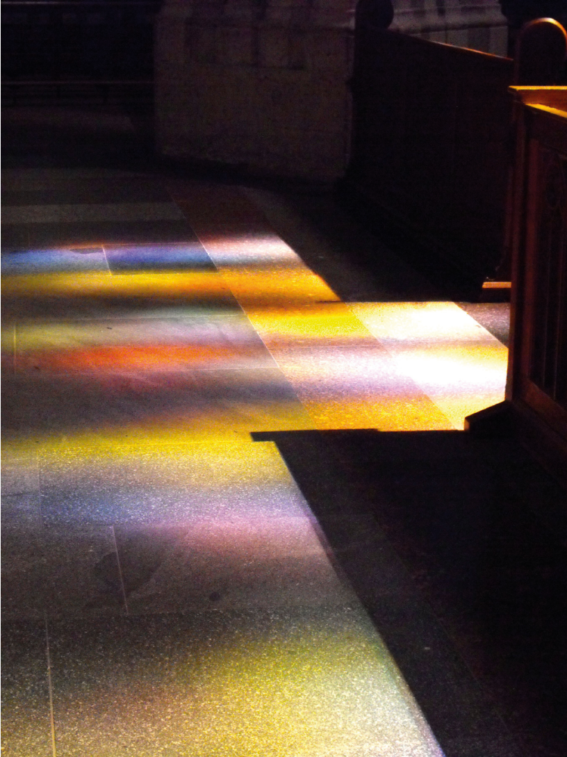
Fig. 2: Reflections of the light shining through Richter's window in Cologne Cathedral. 25