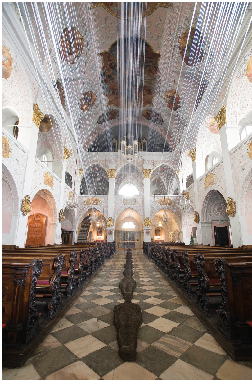
Fig. 3: Elke Maier/Georg Planer, W Erde Licht (2009), very fine white silk yarn, white geese and duck feathers, white marble sand, soil, installation Klagenfurt Cathedral. artwork © Elke Maier & Georg Planer.