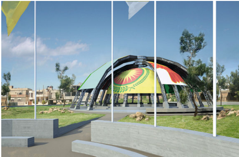
Figure 1: New World Summit – Rojava.

Description: Design of the new public parliament and surrounding park in the city of Derik, commissioned by the Democratic Self-Administration of Rojava (northern-Syria). Artist: Democratic Self-Administration of Rojava and Studio Jonas Staal, 2015-16.