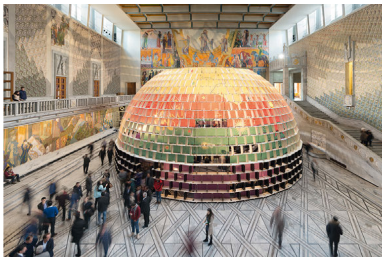
Figure 6: New World Embassy: Rojava.

Description: Overview of the New World Embassy: Rojava in the Oslo City Hall. Artist: Democratic Self-Administration of Rojava and Studio Jonas Staal, 2016. Commissioned by: Oslo Architecture Triennial: After Belonging, After Belonging Agency and KORO Public Art Agency Norway / URO.