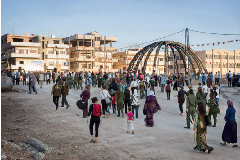
Figure 4: New World Summit – Rojava.

Description: Public arriving for the celebration of the construction of the new public parliament and surrounding park in the city of Derik, commissioned by the Democratic Self-Administration of Rojava (northern-Syria). Artist: Democratic Self-Administration of Rojava and Studio Jonas Staal, 2015-16. Photo: Ernie Buts.