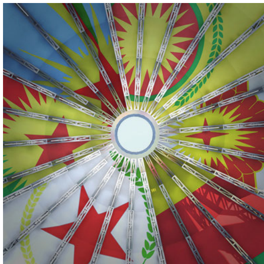
Figure 3: New World Summit – Rojava.

Description: Design of the inside of the roof of the new public parliament in the autonomous Rojava region: clockwise from top-center these depict the flags of the autonomous Rojava region, the Syriac Union Party (SUP), the Movement for a Democratic Society (Tev-Dem), the Democratic Union Party (PYD), the Rojava Democratic Youth Union (YCR) and the Star Union of Women (Yekitiya Star). Artist: Democratic Self-Administration of Rojava and Studio Jonas Staal, 2015-16.