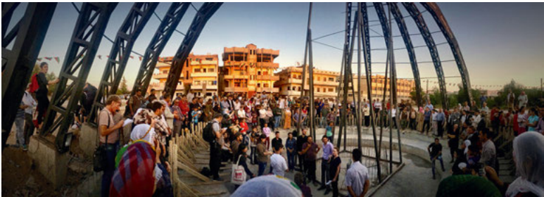
Figure 5: New World Summit – Rojava.

Description: Public celebration of the construction of the new public parliament and surrounding park in the city of Derik, commissioned by the Democratic Self-Administration of Rojava (northern-Syria). Artist: Democratic Self-Administration of Rojava and Studio Jonas Staal, 2015-16.