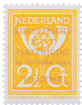
Figure 5: Stamp issued by the Dutch Postal Administration on the Occasion of the European Postal Congress of 1942 in Vienna.

An overprint reading ‘European PTT union, 19 October 1942, 10 cents’ connected the stamp to the congress. 857 The reuse of the motif might have been due to financial issues. A new motif would have meant paying an artist. In addition, the old motif contained the face value of the stamp (2.5 cents), which was overprinted by the new face value, 10 cents. This suggests that finding a motif for this stamp did not take as long as it did in Germany, for example. The focus was on postal relations; no ideological symbols can be found. There were slightly fewer than 7.1 million copies, which represented about 1% of the special stamps issued that year. Thus, the stamp could not have been very visible to the public.