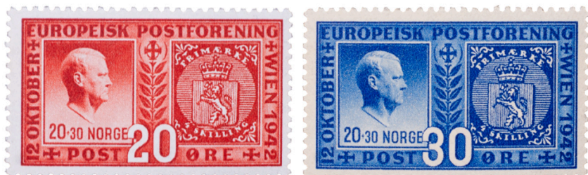
Figure 4: Stamps Issued by the Norwegian Postal Administration Commemorating the European Postal Congress of 1942 in Vienna in Red and Blue, © Posten Norge.

planned, but due to destruction, the number of stamps brought into distribution was lower, namely 1.9 million and 1.1 million. 850 The sale of the stamps ended on 1 January 1943, 851 and in 1944, the decision was made to destroy the rest of the stamps, which had not been sold. 852