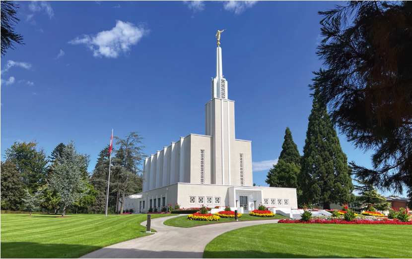
Fig. 4: The Zollikofen temple (Bern, Switzerland) was the first Latter-day Saints temple built and dedicated in mainland Europe in 1955.

erence to its Italian context 30 which connects the temple with Italian folkloric culture and its stereotypical architecture, although other differences of regionally typical architecture are not taken into account.