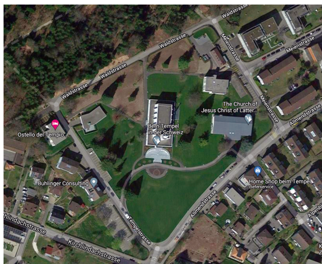
Fig. 3: The Bern temple area in Zollikofen consists of a temple hostel, a meeting house, and administrative buildings, Google maps (accessed August 30, 2021).

that lead towards it and in a way celebrate the entrance to the temple complex. The temple complex usually consists of the meeting/community house or church where Sunday services are held, the temple itself, and the visitor centre. In some cases, a temple hostel called »patron housing« and administrative buildings, occasionally combined with a family history centre, are also located in the surrounding area. Sometimes, one of the streets adjacent to the temple references the building, such as »Tempelstrasse« in Zollikofen (Bern temple) or »Am Tempel« in Friedrichsdorf (Frankfurt temple), marking the temple as a landmark in the surrounding urban context.