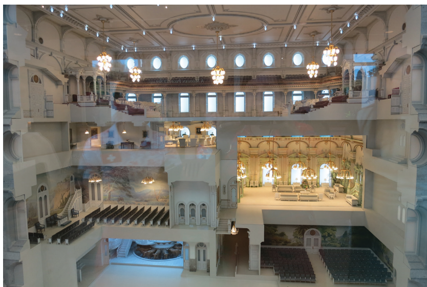
Fig. 5: The model of the Salt Lake City temple shows the different temple levels and rooms. The illuminated space is the celestial room.

Inside the temples, the light in the different rooms and hallways is warm and bright, without any dimly lit corners. Everywhere, the same high-key light is used that connects the rooms by means of the same luminosity. Although decorations and furniture differ from temple to temple, there are some common characteristics. Comparing the celestial rooms of the Salt Lake City Temple, 32 the Frankfurt Temple, 33 and the Rome temple, 34 it is apparent how a similar atmosphere of »perfection« is achieved in each of the rooms even