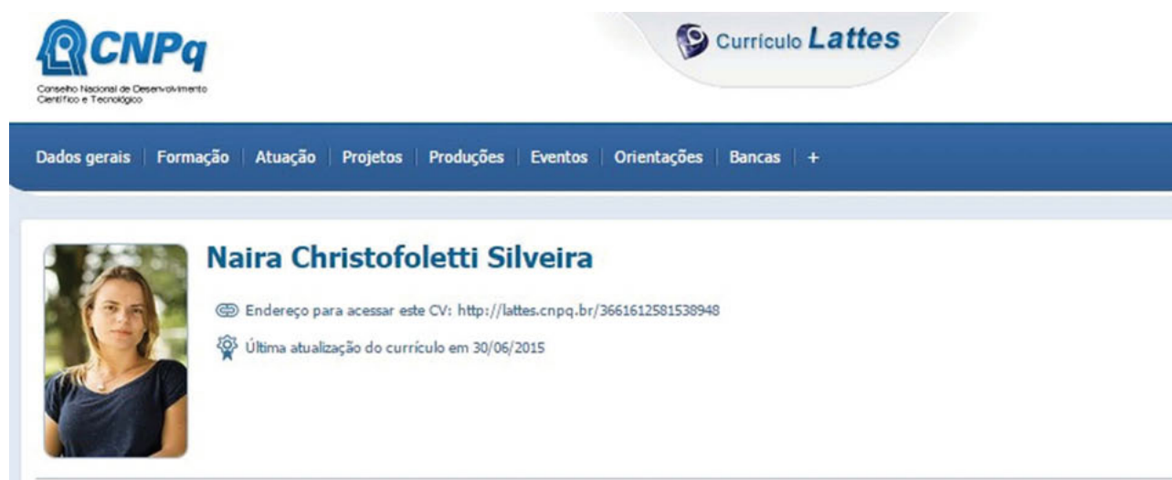
Figure 5. Sample of Plataforma Lattes—CNPq. http://lattes.cnpq.br/ .

ety”) is closely related to language games which manipulate names and images of faces, profiles, etc. As early as 1934 Otlet stressed the need of certain authors to relate their names to photographs (pictures) in books. Along with the identification of movements that intend to enhance the difference between representing the author of a document (information representation) and the author as access point (knowledge organization), it is possible to ascertain the difficulty of matching the documental representation with its large volume of documental production and the necessity of feeding databases. Such a “selfie society” is already “manifested” in knowledge organization, but with the flaws and challenges of the current cultural changes. A typical example is the aforementioned VIAF case. It is a