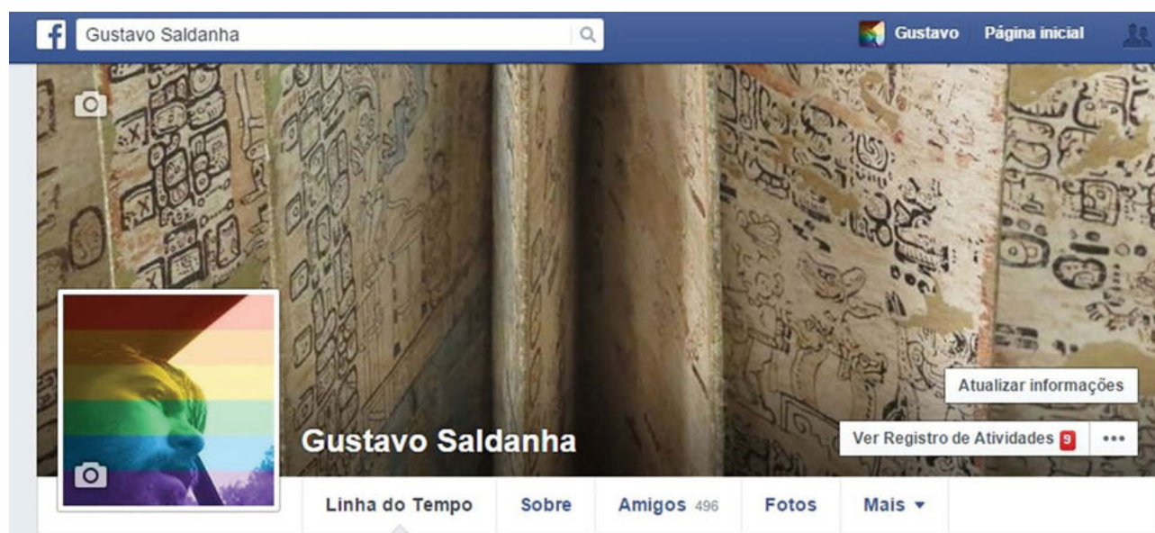
Figure 4. Sample of Facebook profile. https://www.facebook.com .