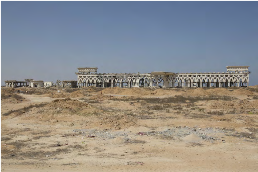
Fig. 35: Kent Klich, from the photo book GZA On Land and Air , 2024. 38 x 25 cm. Courtesy: the artist. GAZA International Airport , GZA, 2016–2017.

This temporal disorientation presents an obstacle to viewers seeking to identify the series of logically and chronologically related events which would normally constitute the fabula of a conventional narrative; however, it also foregrounds the temporal disjuncture in the lives of Alia and Dunia that locks them in different experiences of time. As Muller observes, 'for Dunia this life is in vitro , outside her