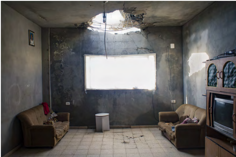
Fig. 30: Kent Klich, from Gaza Photo Album , 2009. Photograph by the artist of Mohammed Shuhada Ali Ahmed's destroyed home at Tuffah, Northern Gaza Strip. 25 x 17 cm. Courtesy: the artist.