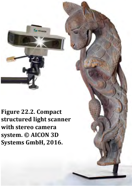
Figure 22.2. Compact structured light scanner with stereo camera system.