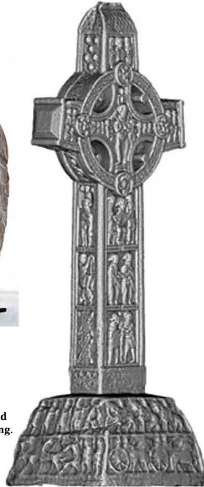
Figure 22.3. Cross of the Scriptures, Clonmacnoise, Ireland.

ambient light. Some structured light systems project patterns in the near infrared spectrum, making them invisible to the human eye. Monochrome cameras capture more light per pixel, produce less pixel noise, and thus ensure better 3D data quality than colour cameras. Scanning systems with colour cameras on the other hand have the advantage that shape and colour are captured at the same time. Scanners with colour cameras are only available with white or infrared light projection.