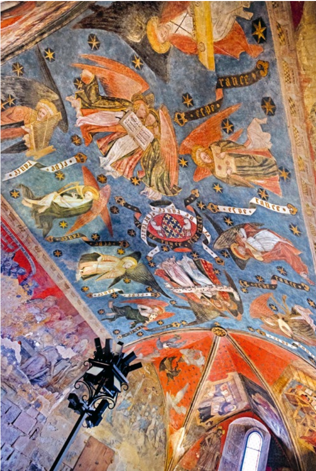
Fig. 5 Musician angels and the coat of arms of the Dukes of Bourbon and the belts of Espérance, 1416–1417, tempera and oil, Collegiate Church of Saint-Bonnet-le-Château, vault of Saint Michael's Chapel (Photo: Yuko Katsutani, with kind permission of Saint-Bonnet-le-Château).

On the chapel vault of Saint-Bonnet, a musical excerpt from a Mass of the Assumption is linked to the belt of Espérance , underlining the link between the two. This music is presented here, not just because in chronological terms the Assumption precedes the Coronation of the Virgin that is depicted on the western wall, but also because it honours Louis II in the context of his Marian devotion.