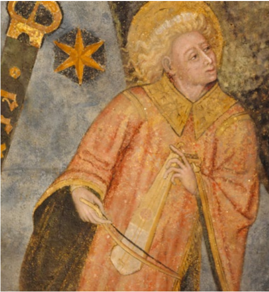
Fig. 1 Angel musician with rabab , 1416/17, tempera and oil, Collegiate Church of Saint-Bonnet-le-Château, vault of Saint Michael's Chapel (Photo: Yuko Katsutani, with kind permission of Saint-Bonnet-le-Château).