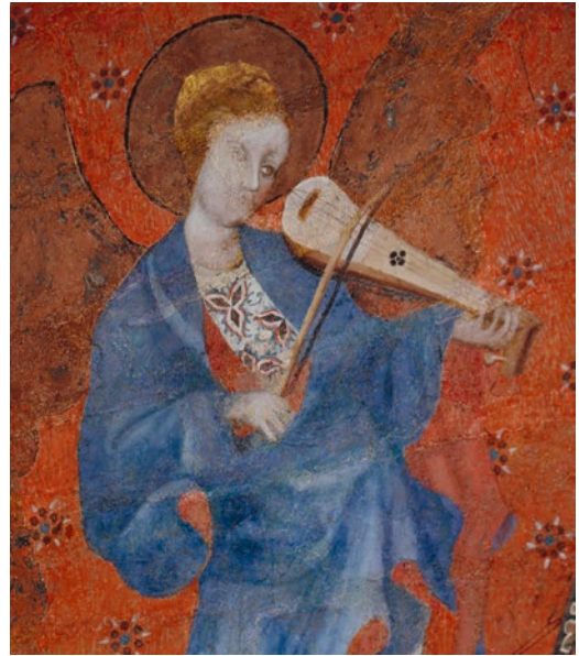
Fig. 2 Angel musician with rabab , 1370–1378, murals applied directly on stone without a fixed layer of preparation, with wax used for some parts (encaustic painting), Le Mans, Cathedral of Saint-Julien, vault of the Virgin's Chapel (Photo: Yuko Katsutani, with kind permission of Le Mans).