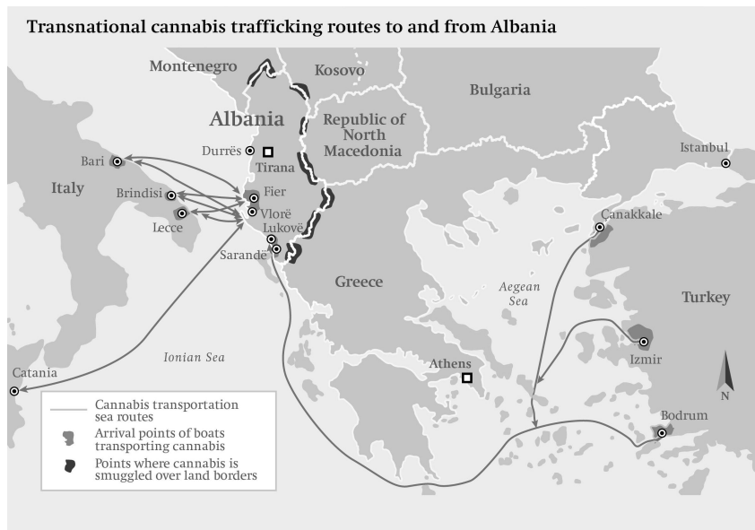
Figure 1: Transnational cannabis trafficking routes to and from Albania

These criminal organisations were not only able to create large networks within Albania but soon started to do so throughout the European continent. Their experience in trafficking cannabis and heroin in Western Europe and the networks of distribution that they were able to create opened the door for their involvement in the lucrative cocaine market. Creating direct connections with the criminal groups in Latin America, these organisations were soon able to transport tonnes of cocaine to some of the main ports in EU countries and also take care of its distribution in the streets of Europe's largest cities. Towards the end of the first decade of the 21st century, cannabis became merely one of the illicit commodities that they had a grip on (Kemp 2020: 31). They were also able to launder money generated from the cultivation and trafficking of drugs, mainly in the construction boom that swept Albania after the fall of communism (Reitano and Amerhauser 2020: 27).