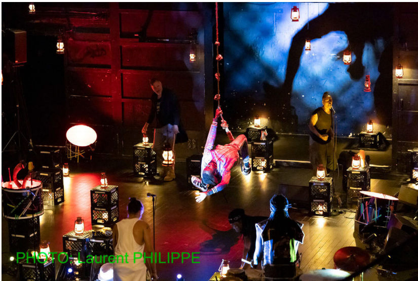
Figures 1 (p. 221) and 2 (p. 223). Nehanda (2022) by nora chipaumire, presented at Espace Cardin during the Festival d'Automne in Paris, France.

JP: With regard to hypervisibility: in your acclaimed opera Nehanda (2022) opacity is preeminent.