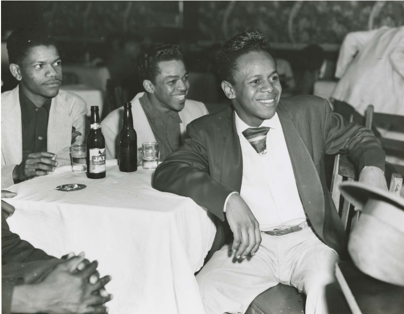
Figure 7. Patrons at Tiajuana Club, including James “Sugar Boy” Crawford (well-known author of “Jock-A-Mo”) on the right, 1953 (Box 8 #139, Ralston Crawford Jazz Photography).

To cisgender, straight Black men in the audience, watching a female impersonator on stage may have been a way to toy with heteronormativity without endangering it. In the performance of their own femininity, Patsy, Princess Lavonne, and Roberta embodied bawdy, up-front, actively flirtatious women, but Hale, Penniman, and Gibson deactivated the act’s threatening potential by claiming “mere” performance. Looked at in this light, the female impersonators were not threatening to hegemonic masculinity, and a man could respond to the “girl” on his lap without being assigned to the effeminacy or homosexuality that such behavior would have suggested if indulged in a different venue.