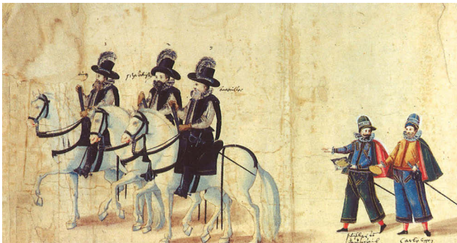
Figure 1. Scene with Christopher Columbus and Amerigo Vespucci at the Stuttgart Court, Carnival 1599 (Stiftung Weimarer Klassik, from Elke Bujok, Neue Welten in europäischen Sammlungen; Africana und Americana in Kunstkammern bis 1670 , Berlin, Reimer 2004, Abb. 1/1).

Vide pomp / pim / pom / vide / pomp / pim / pom / Hertzog Friderich komt / pom / pim / pom / Hertzog Friderich / Friderich komt / er kommet / er kompt / America kompt / sie kompt / sie kommet / America kompt / die Könige kompt / sie kompt / sie kompt / das pimperle pom / das pimperle pom / pom / pom / Vide pomp / Vide pomp / das pomperle pom / pomp pimp pomp / etc. (Frischlin quoted after Bujok 2004, 14) 2