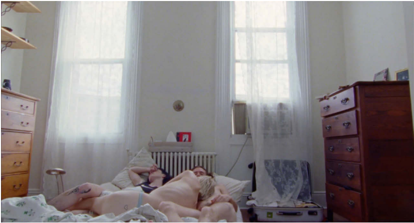
Figure 1. Jessica Dunn Rovinelli, “So Pretty,” 2019, Screenshot, 00:31:25, © Jessica Dunn Rovinelli.

relationships within this central constellation. So Pretty seeks to create a cinematic space for queer and trans bodies, exploring ways of relating beyond conventional regimes of representation. Through its focus on interior spaces, fluid camera movements, and an evocative soundscape, the film evokes an ephemeral in-between space that reimagine relationality. The analysis will follow So Pretty into its social microcosmos and trace the ways in which the film deploys a form of temporal dragging to imagine a community that holds multiple layers of time present.