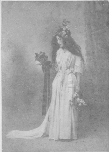
Figure 8. Sadayakko as Oriye (Ophelia) in Hamlet (1903), property of the Tsubouchi Memorial Theater Museum, Waseda University Tokyo, No. F64-00678.

Thus, as Kano puts it, the “definition of [the modern Japanese] actress involves more than a woman performing” (Kano 1995, 32). Her identity is rather formed in comparison to a range of preceding models of performative femininity such as “the male onnagata ... and his performances in Kabuki, New School, and New Theater productions, the Western actress, the onna yakusha (woman player) who appeared in Kabuki and New School, and, finally, the New School actress” (Levy 2010, 232–33). Finally, there were also male onnagata in Kawakami’s productions (Ortolani 1995, 237), so the different types of performers of femininity were not mutually exclusive but competed in a mimetic circle for the greater “naturalness” and the representation of psychological interiority. 25 However, it is important to note that Kawakami introduced explicit scenes of cross-dressing and ethnic drag in various productions. 26 That is, while “straight theater”