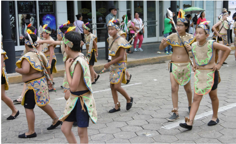
Figure 4. Children representing colonial history, April 23, 2018 Santa Cruz, Bolivia.

music from the Chiquitos' repertoire and local choirs and orchestras, formed by young people for whom musical education might open a door to higher education, an option that is not available otherwise. For these performances, people from the villages, the former reductions, dress up in the way, the Jesuit padres of the eighteenth century would have wanted them to look like: they wear long, plain, simply ornamented dresses. Their performance enables the white audience to meet its own history (Baroque music, pious Christians) in the rainforest—everything of colonial history but the burden, still, again.