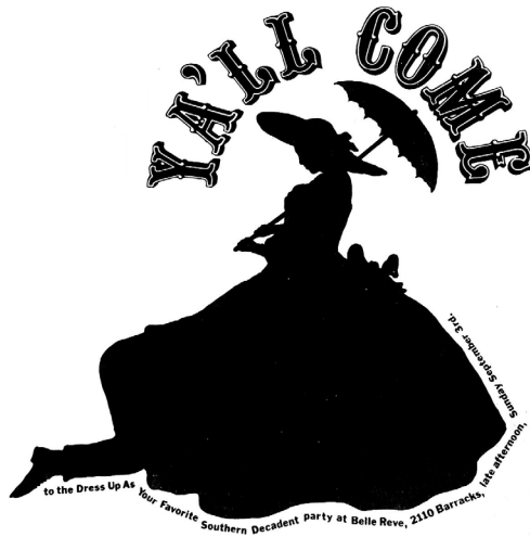
Figure 2. The biggest LGBT+ festival in New Orleans today, Southern Decadence, started as a simple costume party on Labor Day weekend 1972 for which the following invitation—designed by Robert Laurent and featuring a libertine Southern belle—was issued (“Southern Decadence Party Invitations” n. d.).

The converse notions that the South was essentially inhospitable to queer identities or that Black communities there have been largely and consistently homophobic must also be shed (for a refutation of this thesis see hooks 1989, 120–126; Constantine-Simms 2000, 211–225). In other words, before the question of what drag meant to mid-twentieth-century Black performers of New Orleans can be addressed, one must first mine the archival record for snippets of information about nineteenth- and early twentieth-century Black queer lives.