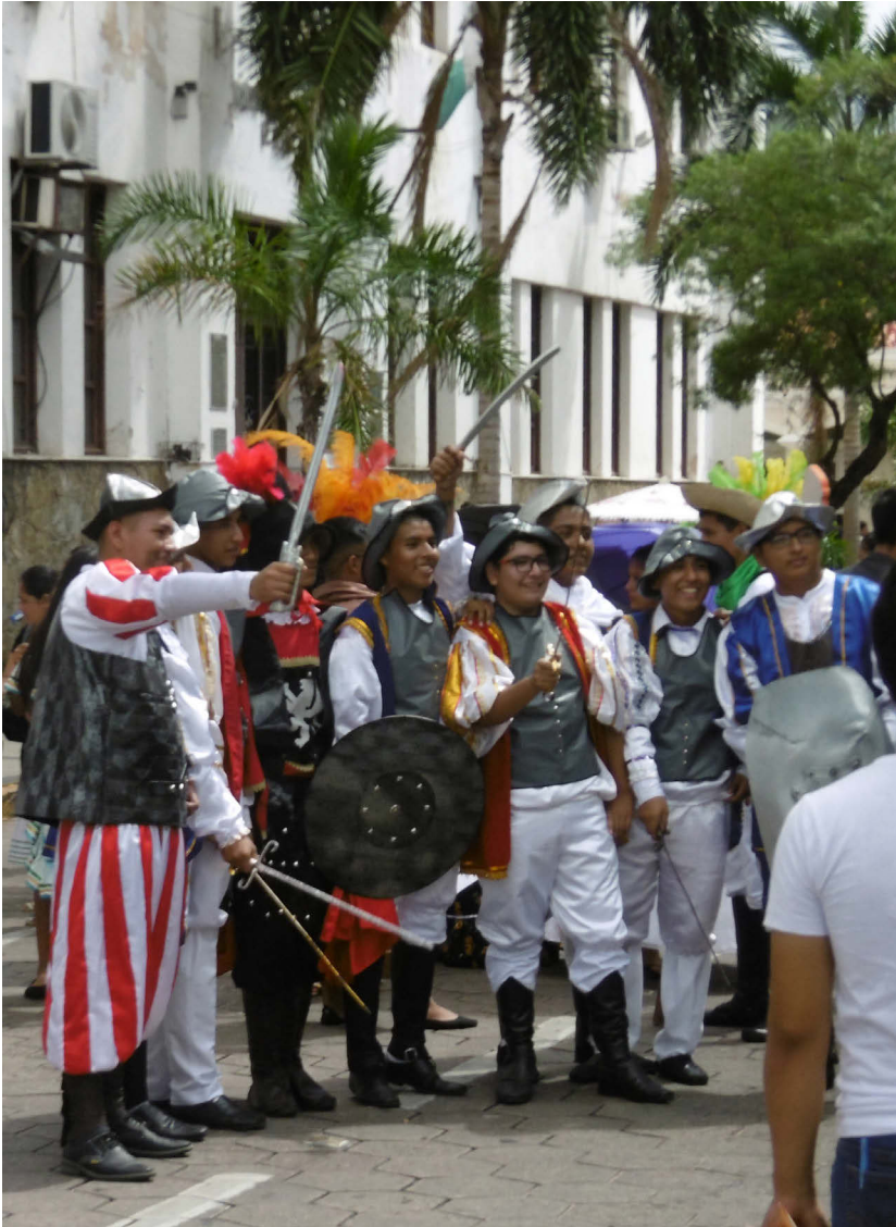
Figure 5. Children representing colonial history, April 23, 2018 Santa Cruz, Bolivia.