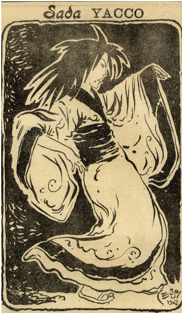
Figure 2. Celso Herminio: Sada Yacco (1902), published in A Parodia 126/3(1902), Lisbon, Photo: BLX-Hemeroteca Municipal de Lisboa.

reflecting the mie pose as a characteristic pausing of the movements in Kabuki as a heightened expression of emotion at the climax of a sequence (Zorn 2013).