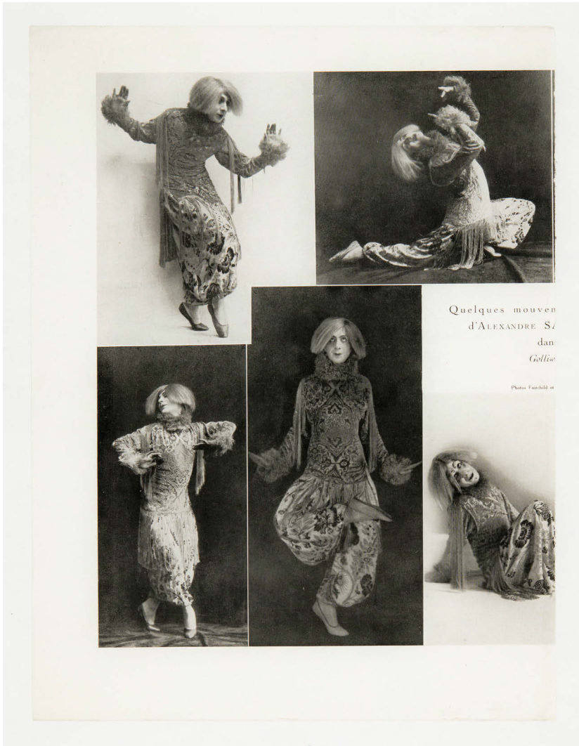
Figure 6. Golliwog's Cake Walk , from "Alexandre et Clotilde Sakharoff: biographie: documents iconographiques" (n.d.), Bibliothèque nationale de France [FRBNF39511909].

The movements are moreover "described as febrile and spirited, and brought off with an extraordinary disarticulation of the limbs, a sense of lightness, and a mastery of the body even when it was held in the most unusual positions" (Veroli 2002, 206). They at best show only traces of the eponymous cakewalk (Fig. 6). Characteristics such as leaning backward, high prances, arms stretched forward, and a low center of gravity can only be found as residues in Sakharoff's dance in exaggerated backbends and poses suggestive of swinging arms. The