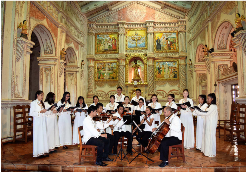
Figure 3. Choir and orchestra San Xavier, Festival de Temporada de Música Misional y Teatro Chiquitos 2018 ( https://festivaldetemporada.com/coro-y-orquesta-de-san-xavier-listo-para-el-festival-de-temporada-2018/ , accessed October 27, 2023).

If we—to conclude—take a brief look into the European and Bolivian present, what kind of cultural practices of “dressing up as Indian” do we encounter? In Europe, “dressing up as Indian” is a common carnival-practice both for children and grown-ups. One could say it is the popularized, mass-culture-compatible, residual version of Frederick’s corporeal representation of Lady America: idealizing and exotifying an “Other” who has seized to exist, or rather, has never existed, as Lady America was nothing more than an allegory in the flesh of a protestant aristocrat. Deeply embedded in the imaginary of the Global North this type of borrowed plumes for temporary incorporation are the type of one-sided appropriation that “drags behind” both idealization and genocide (in the sense of “everything but the burden,” Tate 2023).