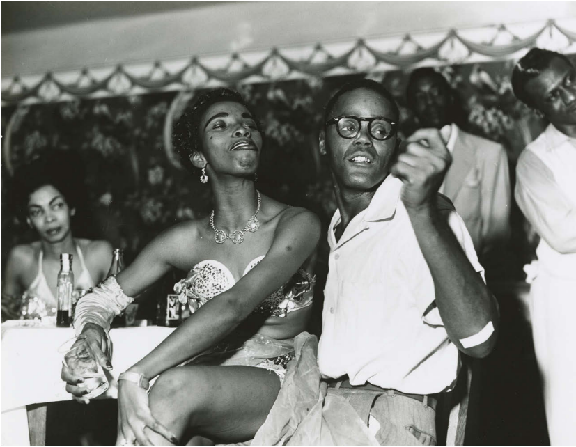
Figure 8. A dancer on the lap of a friend at Tiajuana Club, 1951.