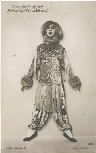
Figure 5. Golliwog's Cake Walk .

As an example, I would like to come back to his aforementioned solo Golliwog's Cake Walk to the music of Claude Debussy. 16 It premiered in 1913, as part of a program in which Sakharoff also performed Baroque-influenced solos. The racist Golliwog doll, inspired by minstrel shows and designed by the illustrator Florence Upton in 1895—a grotesquely exaggerated, childlike, Black figure in a suit 17 —bears no resemblance to Sakharoff's staging: a photo of the solo (Fig. 5) rather shows an Orientalized figure in a doll-like, elongated pose with spread-eagled arms and legs on demi-pointe. The figure wears a blue wig (as a hand-colored version of the image shows) and an Oriental costume—"a marvel of feathers and long fringes" (Veroli 1992, 85)—with puffy pants covered in ornaments. The face is whitened and heavily made up.