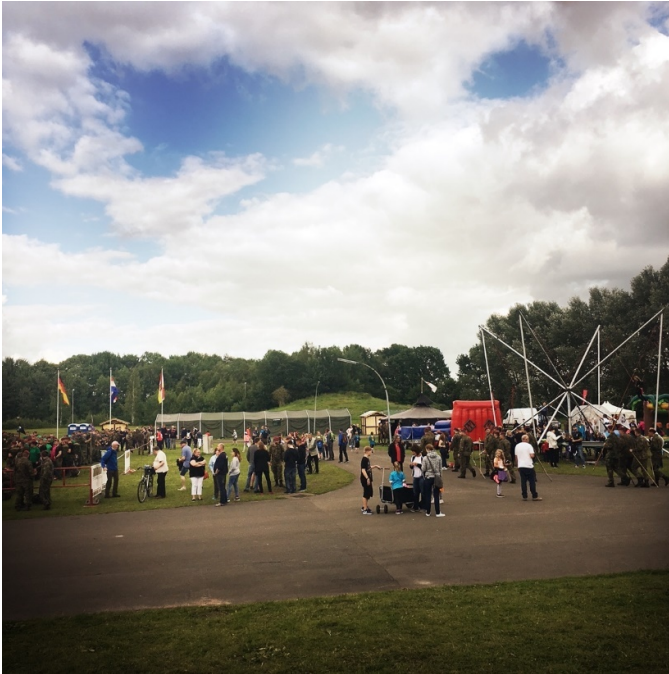
Fig. 3.3: Four Evening Marches in Zeven, view of central starting and end point.

The festival in Zeven is organised by a civil association mainly consisting of local businesspeople, but a festival visitor explained to me that it is supported by the new German military brigade. The military provided one of the leading attractions for children by hanging up a rubber army boat, transforming it into a gigantic swing and giving essential logistic and infrastructural support to the overall festival. Dutch soldiers and a military musical corps came to visit for the event, and people dressed in military clothes. The whole event felt like a typical parish fair with a note of military style, with food stands and some information provided by local associations. Every year, the march highlights a different cause: when I visited in 2018, the campaign against the closure of a local hospital was the centre of attention. An impressive number of groups participated in the march, ranging from soldiers to school and kindergarten classes to local businesses and groups of friends and families. The