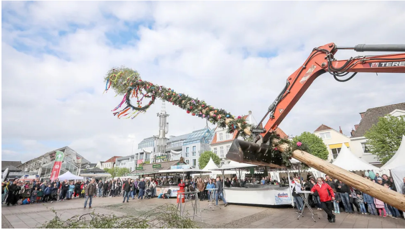
Fig. 3.1: Setting of the maypole in Aurich 2018.

The Maypole ritual in Aurich proceeds as follows: A few days before the End of April, volunteers decorate a birch tree with colourful pieces of paper. On the April 30, the tree is set up in a central square of the community in a festive march through the neighbourhood (Fig. 3.1.). The march often also includes dancing, as the community or specific groups, some of them in East Frisian traditional dress, dances around the tree to transition into the month of May. After being set up, the maypole has to be guarded until the sunrise of May 1st, as the games of stealing other community trees begin. These other communities stem from part of the city and neighbourhoods that de-centrally organise their own festivals, most of them much smaller than the central one in Aurich. A tree is successfully ‘stolen’ when a group from another neighbourhood manages to touch the tree, the tree then belongs to one’s group. It can be released to its original owners when these deliver a crate of beer the following day.