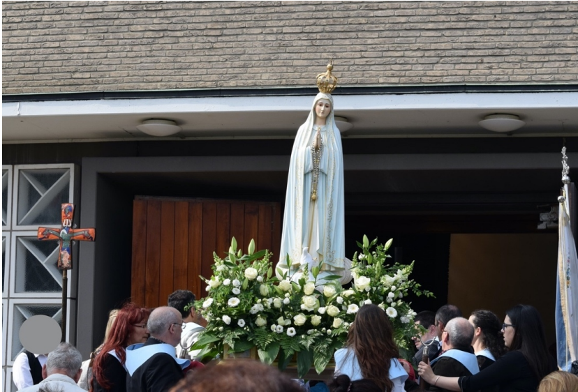
Fig. 3.2: Fatima sculpture in front of Church door in Cuxhaven.

Another Portuguese festival in Cuxhaven is the local fish festival, which has an overall commercial character. Due to the history of Portuguese workers in the town's fishing industry, this festival can, as one blogger phrases it, 'not be thought of without thinking of Portugal as well' ('kuestenglueck.com', April 10, 2020, my translation). 6 The festival occurs once a year in the historical buildings of the fish auction hall, the active fish industry having moved to a new part of the harbour. The auction hall is itself a tourist attraction, playing host to gastronomy, tours of specific ships in the harbour, and music performances, some of which were by the local Portuguese rancho dance associations. Organised by a local fishing industry interest group, the festival also offers several fishing-related attractions such as a tour through the harbour.