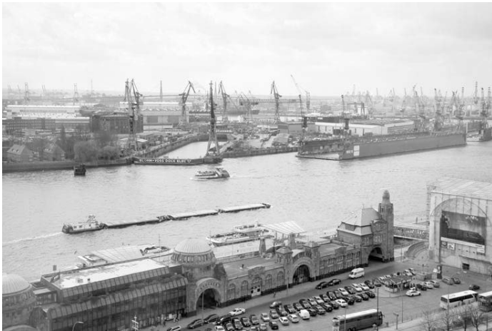
Fig. 1: Convoy of freighters passing Hamburg's inner city piers (Landungsbrücken)

For most residents of Hamburg, the Elbe and the harbour constitute not only a major attraction which they can look out on from the town centre, but also a barrier to their mobility, although new town planning projects, aiming to reduce this inconvenience, invoke a "leap over the Elbe" (FHH 2005: 4). On the other hand, the residents of Hamburg make use of the Elbe to take their guests on harbour tours, hundreds of thousands take part in the port's annual birthday party and politicians regularly stress the importance of the port for Hamburg.