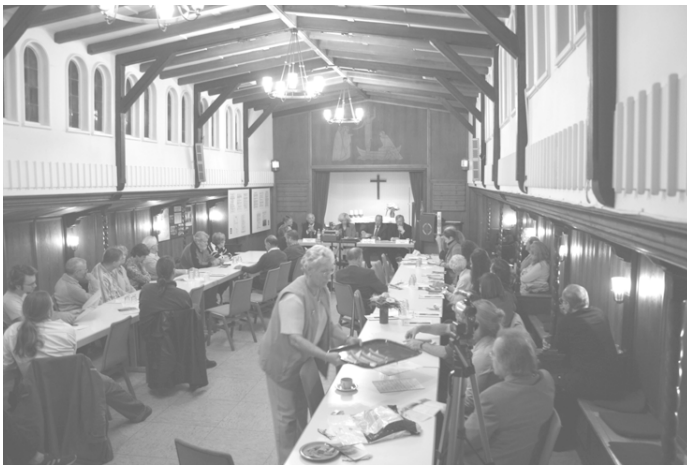
Fig. 5: Public event on the Riverboat Church

My fieldwork in the Hamburg port was part of a comparative research project on urban transformation in different European port cities (Kokot 2006). Research was conducted in cooperation with local NGOs addressing local effects of urban change in port-related areas. In my case, this was the Hamburg Riverboat Church, which traditionally had offered its services to inland waterway sailors. One result of this co-operation was a series of events, in which the inland sailors' concerns and their suggestion for improvement were presented to the public.