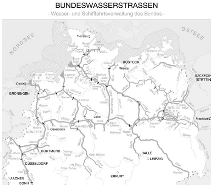
Fig. 2: Map of inland water ways served from the Hamburg port

1997: 115ff). Furthermore, regarding the space required by “containerisation” of all maritime transport, in Hamburg the relocation of the port to areas south-west of the city did in fact start in the 1960s, but continued beyond the end of the millennium. In this process, the dominant dynamic was the container ship sector, making the port city of Hamburg, according to turnover figures, Germany’s number one port in terms of technical development of the ship industry (Berenberg Bank – HWWI 2006). 3