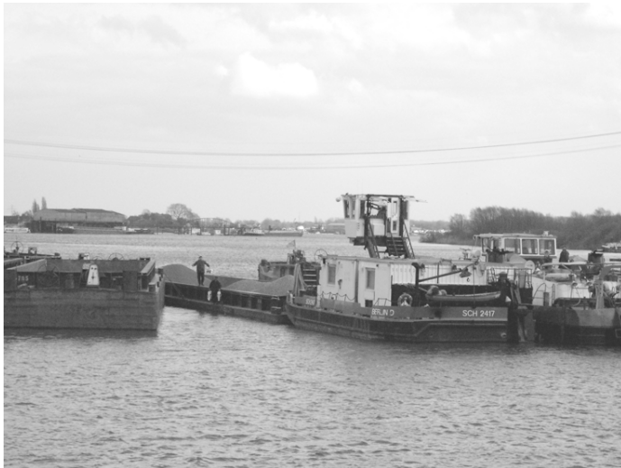
Fig. 4: Inland ships docked in the bay of Billwerder

All in all, my findings show that possibilities for inland sailors to spend their ever-dwindling free time in Hamburg and to find and maintain contacts on land have decreased significantly.