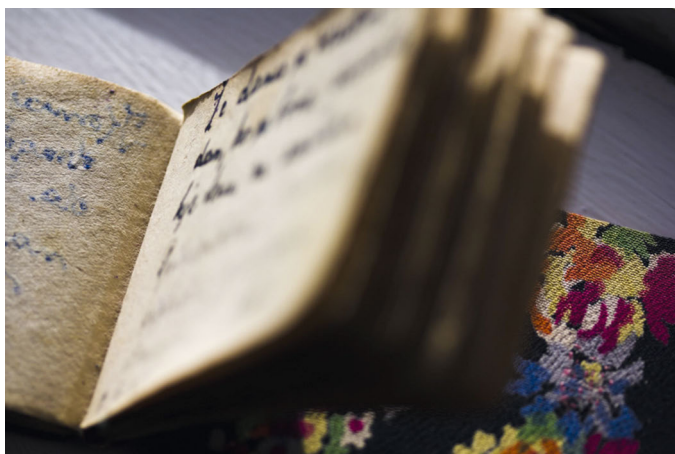
Figure 6: Walking a mile in Viktorija's shoes: still in motion.

Women's accounts written just before, during and straight after the liberation of the Ravensbrück concentration camp are testimonies of survival and hope. This autograph book serves as a place where women's voices live endlessly. These 52 accounts can be categorized in 5 types of messages: of command, of freedom, of suffering and sacrifice, proverbs, and messages that are promises to keep in touch. All these themes found a place in this little booklet. In line with Jordan, we recognize that the friendship book provides a place within which practices of relational resilience are nurtured. The process of writing 50 has been recognized as a common practice of individual coping in times of war. However, as we argue in this paper, a cacophony of women's voices presented in this friendship book extends the idea of resilience beyond the individual, by namely understanding resilience as an ability to connect with others (women). Relationships of contact, support and care, are built and nurtured through practices of mutual empathy,