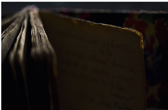
Figure 1: Tiny and fragile. The book is full of cracks, crests, textures. It exerts experience. It feels very personal and at the same time, collectively significant.

A beautiful, tiny, handmade autograph book rests on my hand. This tiny notepad is shy and with good reason. Its inscribed pages hold memories of abduction, incarceration, forced labor, suffering, war and death. Commemorations of war are collectively revisited as a platform for national histories. Individual experiences of war are neglected as if tucking away those lived experiences could make them vanish. For the first time in over half a century, this tiny autograph book stumbled across a visual researcher. My job was to document each of its pages so that they could live long after their already crumbly pages disintegrate. When turning the pages, I lightly pinched the corners, but I could still not avoid producing some more paper shreds which landed on the grey carpet of my office and tormented me from there. Objects are marked through successive moments of consumption across space and time. 5 Social relations existing in and through material worlds. Words written in confinement and now confined to disappear.