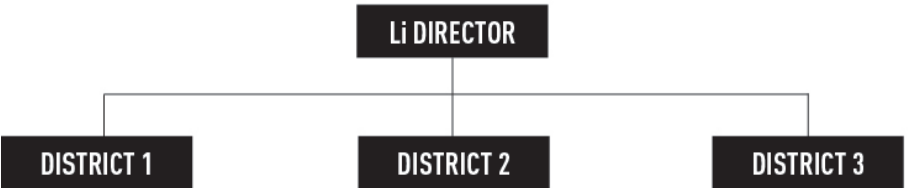
Figure 2: Library services – organisation structure 2007–Dec. 2014

The integration with the citizen services department began in May 2012 with the appointment of an interim director to take over from the former library services director. With a brief to downscale library services resources, she cut the staff, discharging four persons and entering into severance agreements with a further six employees. Three deaths had occurred during the period. Later, nine employees left their jobs for various reasons. A permanent director was appointed in May 2013, tasked with amalgamating the two services into a new organisation with a branch in each of the three districts. In September 2013, a new head of library services was hired, bringing the management team to a total of five people. Figure 3 shows the result of the amalgamation.