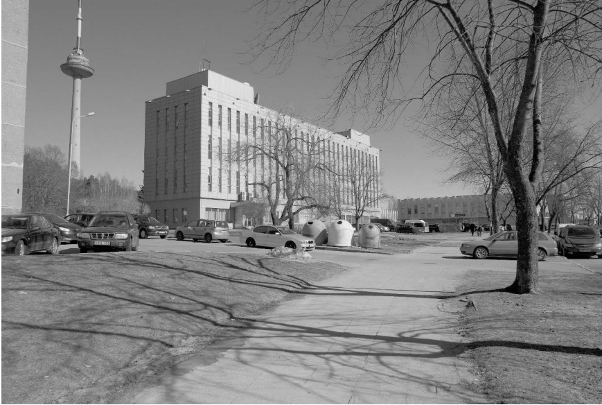
Figure 7. Transmission Department in 2017.