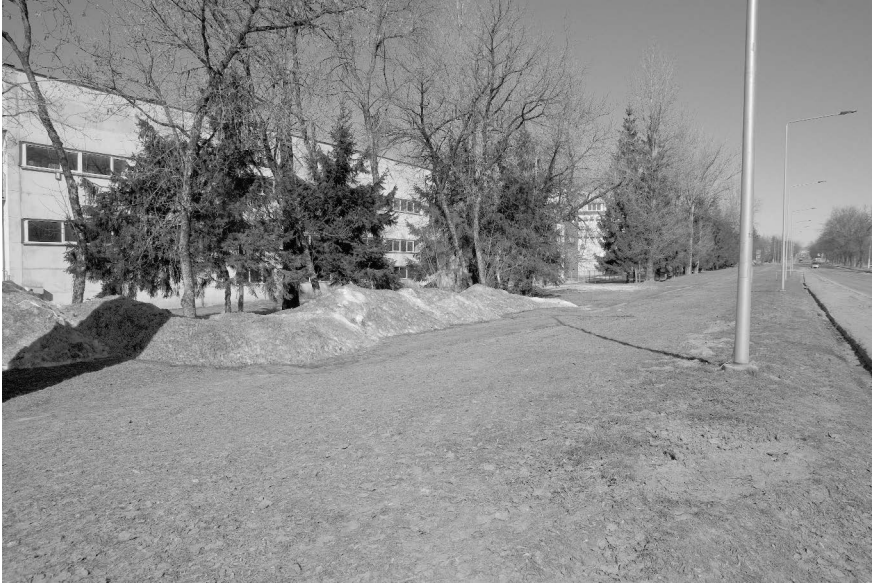
Figure 10. Revisiting one of the digging sites, where the soil was evened out and the cables were already covered with soil and thus invisible.