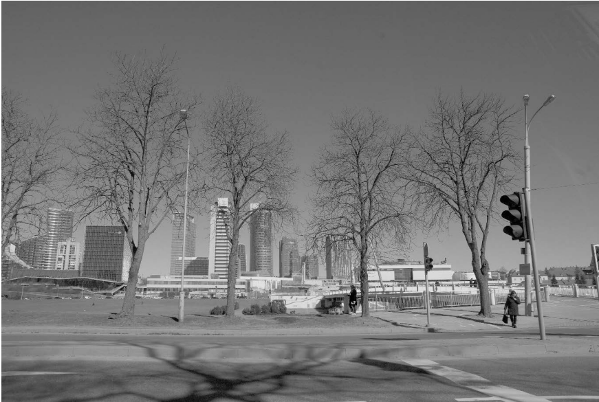
Figure 8. Representative side of Šnipiškės. The orange building in the center is the Telia Lietuva Head Office that I visited in 2018.