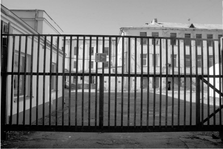
Figure 5. Entrance to the hacker space in 2017.