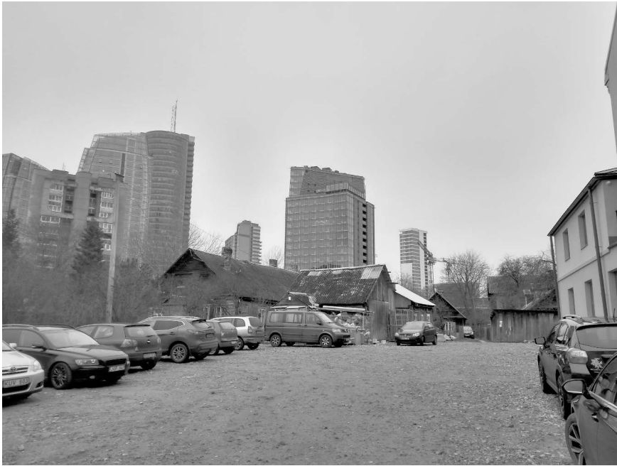
Figure 9. Visiting Šnipiškės from the other side. On the left side is the Telia Lietuva Head Office that I visited in 2018.