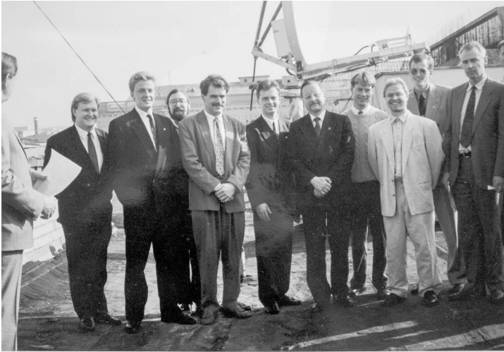
Figure 4. 10 October 1991: On the rooftop of the Parliament in Vilnius after the establishment of an Internet antenna (visible in the background).