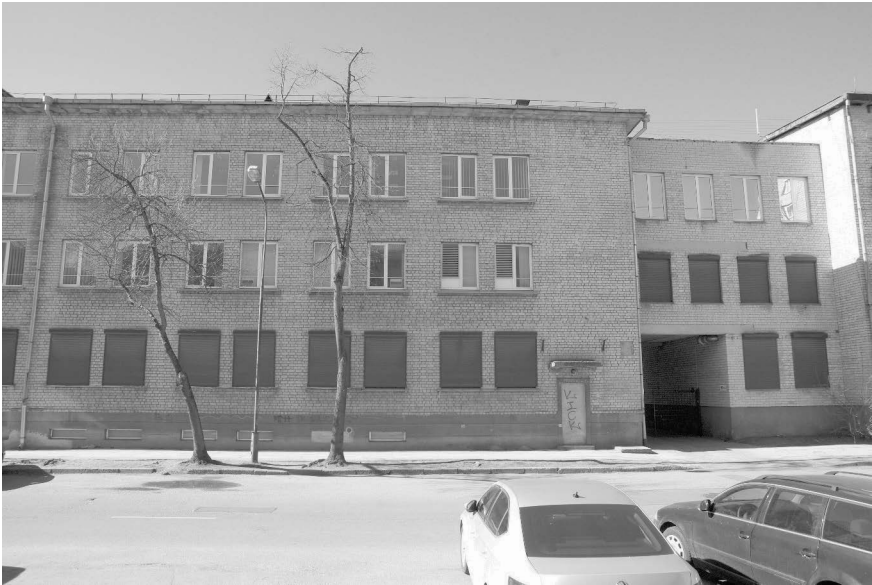
Figure 6. Physical Network Department in 2017.

The stark differences between these spaces spoke to an idea of advancement, which was reinforced by physical differences. For example, network transmitters, who engaged in office-based rather than manual labor, had small office rooms separated by glass. Employees from the Transmission Department additionally required me to provide more explanation before I could observe their practices. After I was offered coffee and cookies, they expected me to ask precise questions, describe my research premises, and defend the meaning of my research before I could begin. In contrast, at the Physical Network Department, employees usually did not question why I was there and were furthermore open to sharing their knowledge, experiences, and jokes. In this context, I could either work on my computer or question employees without any resistance.