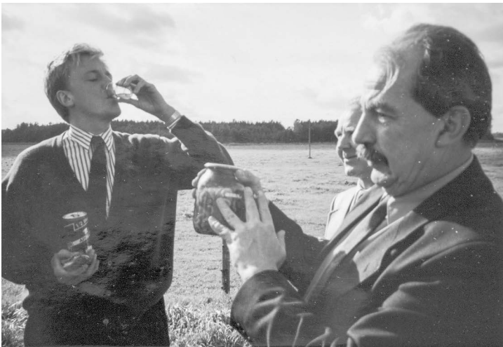
Figure 1. 1991: Lithuanian academics from the Institute of Mathematics and Informatics of Vilnius University greeting Norwegians in Tallinn with kompotas, a sweet fruit drink.