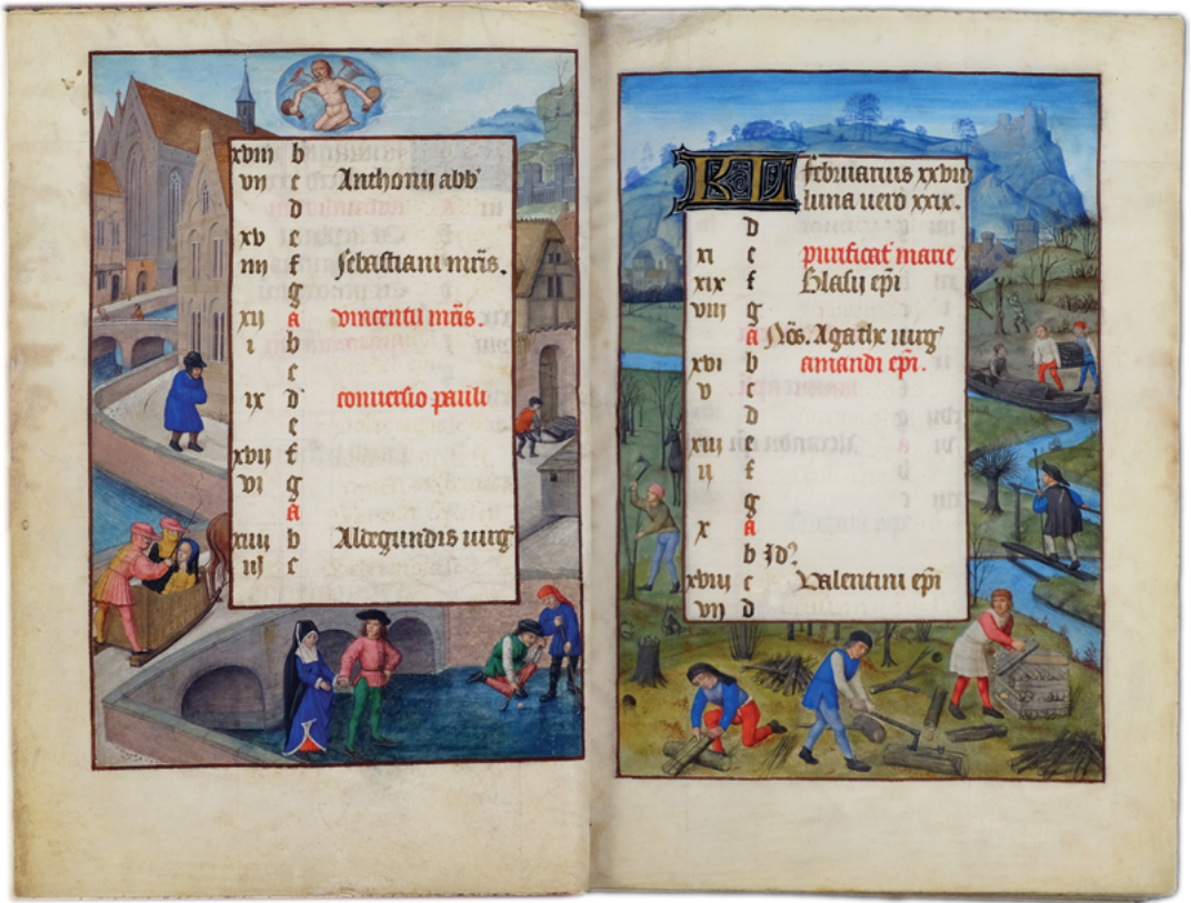
Figure 21.4. Calendar miniature for January (second half) and February (first half) illuminated by the David Master. Durrieu Hours (now private collection, sold by Heribert Tenschert in 2022), © Heribert Tenschert. Courtesy of Heribert Tenschert.

de Besançon. 17 He explored French regional schools and illuminated manuscripts at the time when printing was thriving. 18