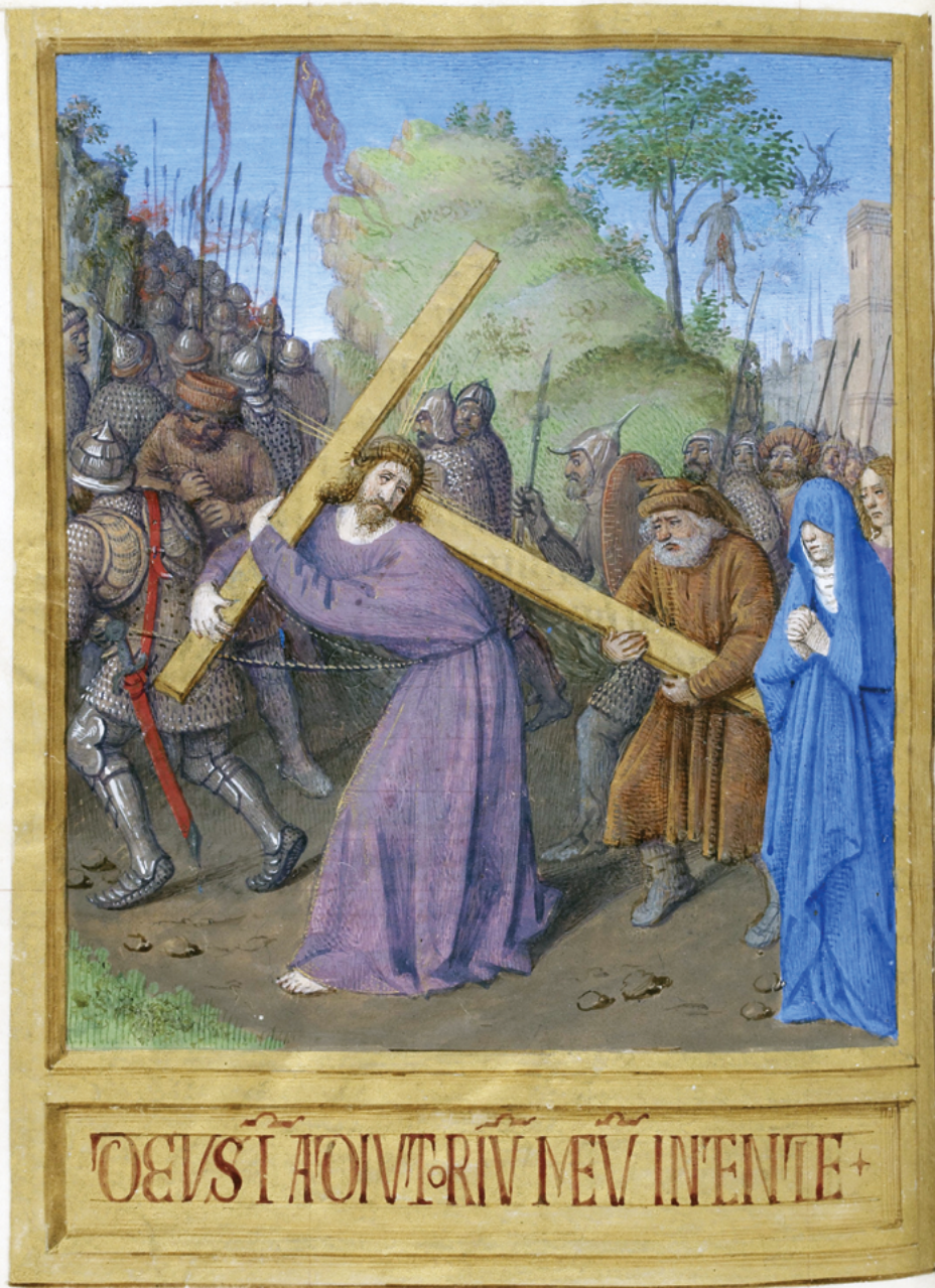
Figure 21.3. Baudricourt Hours, Bibliothèque nationale de France, NAL 3187, fol. 74v.