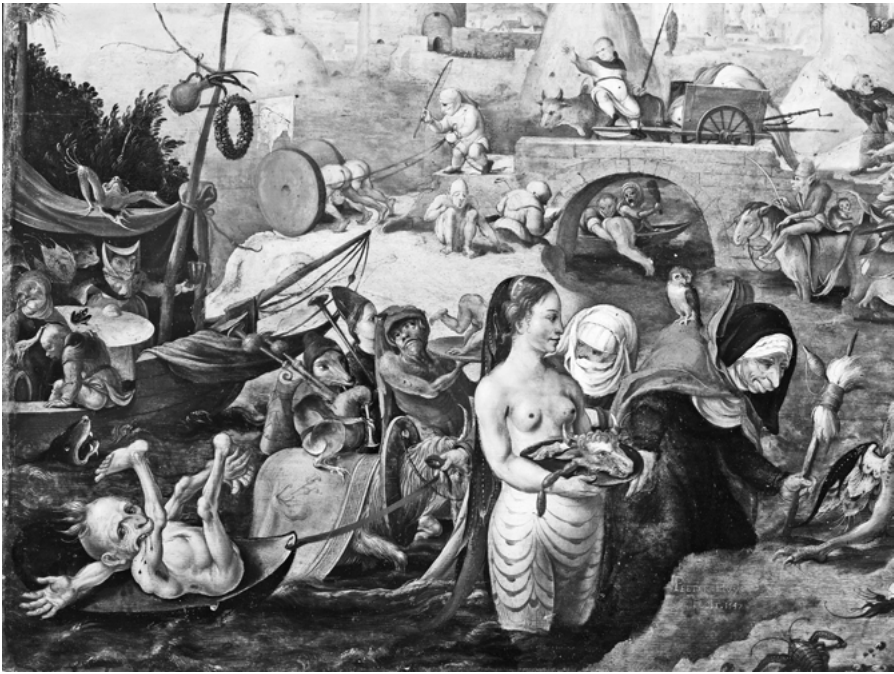
Figure 21.5. Pieter Huys, La tentation de saint Antoine , ca. 1520–1577, Paris, Musée du Louvre, RF 3936. Photo © RMN-Grand Palais (musée du Louvre)/Gérard Blot. Used with permission.

schert in 2022, Figure 21.4), the Prayer Book of Charles the Bold (Los Angeles, J. Paul Getty Museum, MS 37), which he attributed to Philippe de Mazerolles (now Lievin van Lathem), the so-called Gruuthuse Hours (private collection, sold by Günther in 2014), a Carthusian Book of Hours (private collection), and four folios painted by Simon Bening from Enriquez Ribera’s Book of Hours (Last Supper at the Cleveland Museum of Art, 2002.52), a Book of Hours (use of Rome) painted by the Mildmay Master (private collection), and more. 19 As early as 1891, Durrieu had defined the Ghent-Bruges school, based on the Grimani Breviary, as a product of the southern Netherlands produced between the last quarter of the fifteenth and the mid-sixteenth century. 20 Durrieu’s interest in Flemish illumination distinguishes him from his French contemporaries.